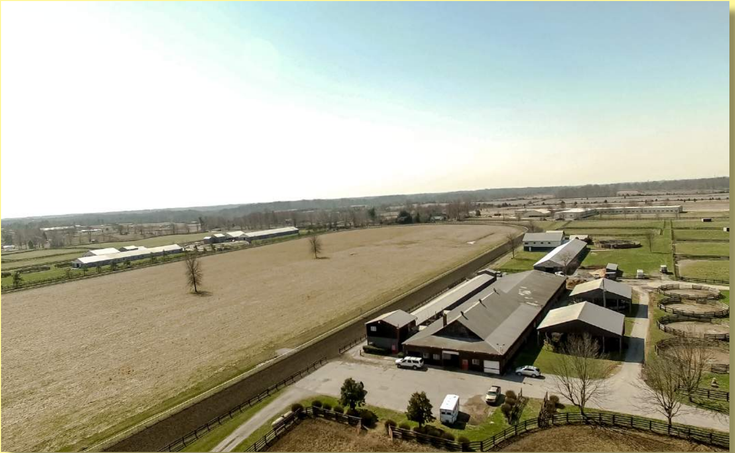
6 Furlong all-season synthetic training track