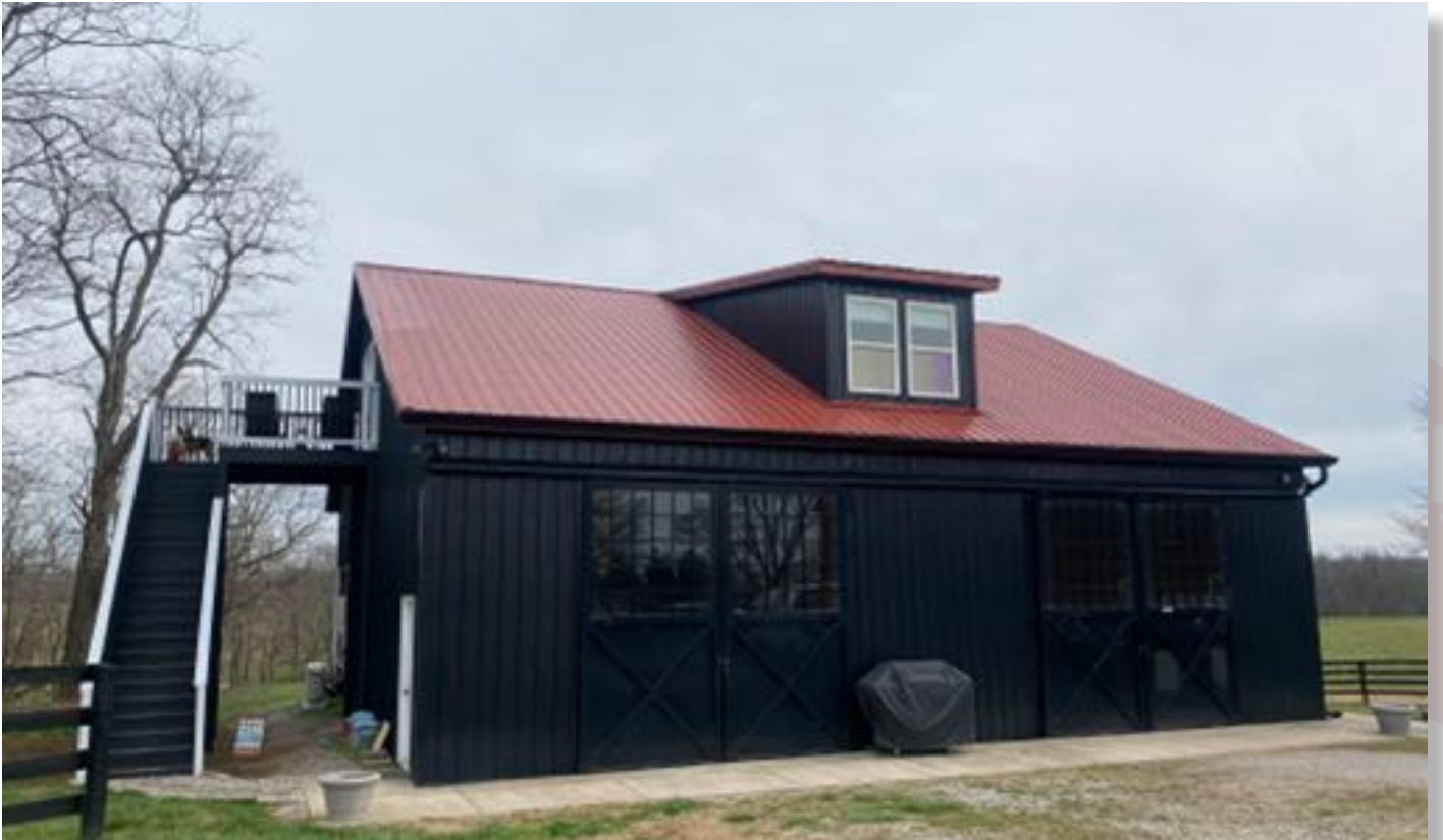
Large 50x50 garage with 2 apartments