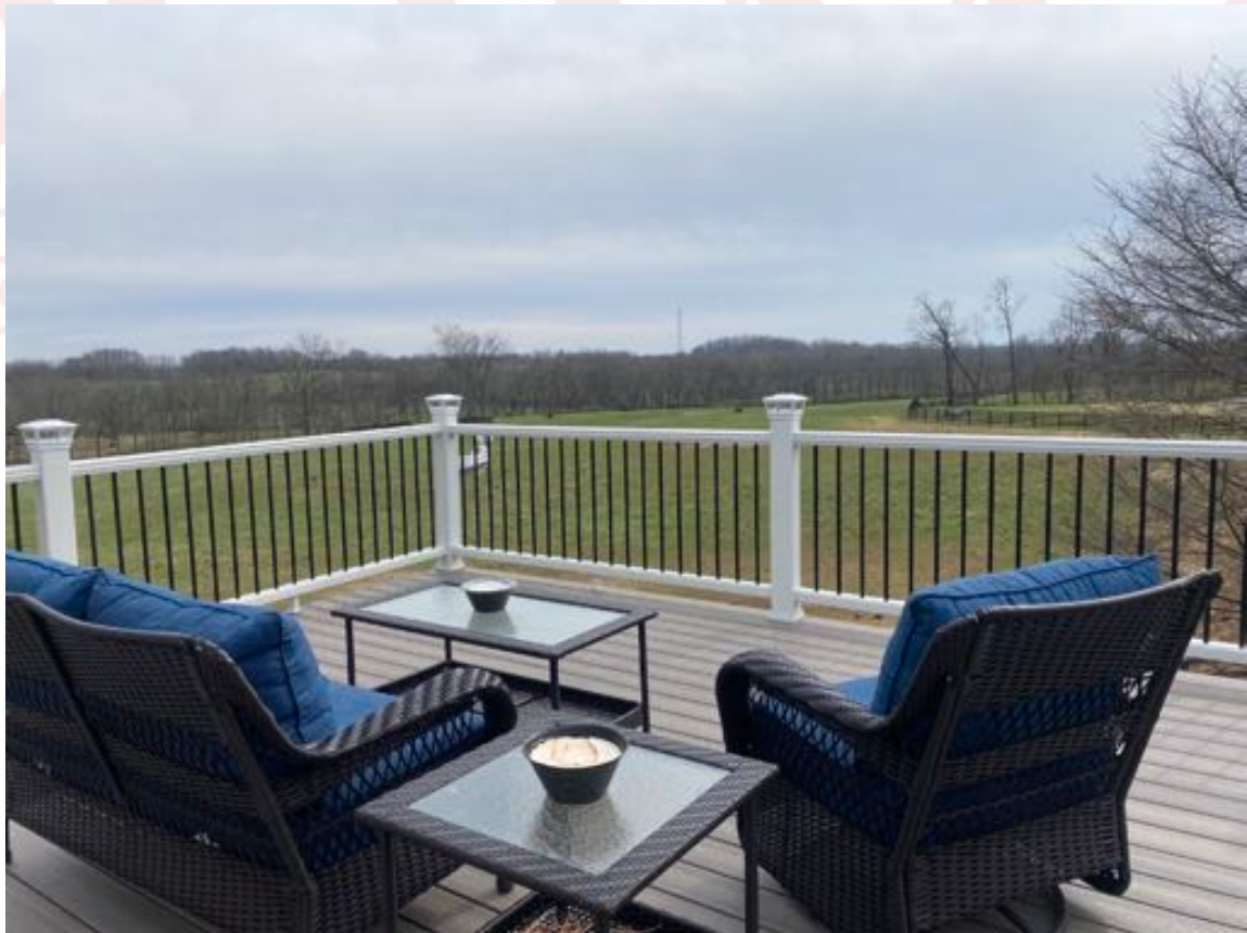
Deck with beautiful views of the property