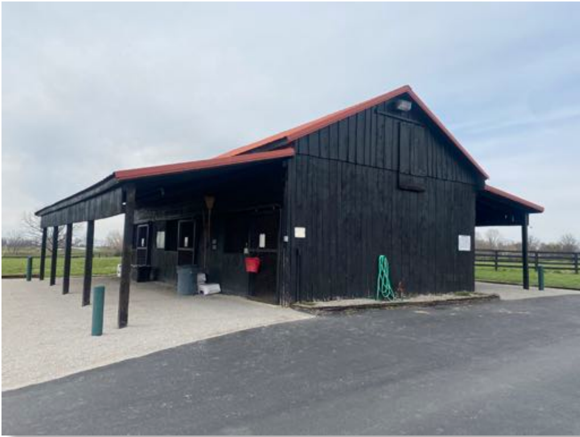
6 stall barn