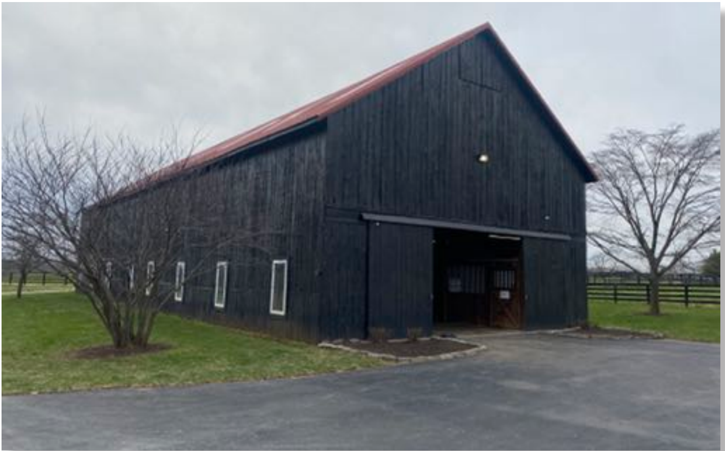
15 stall barn with loft