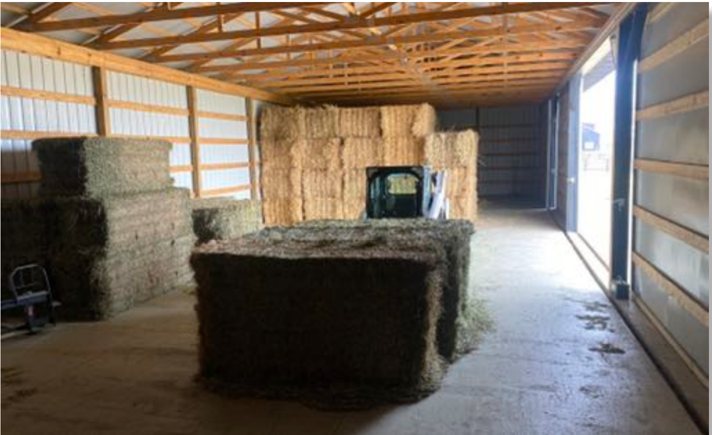
Interior of storage/hay barn