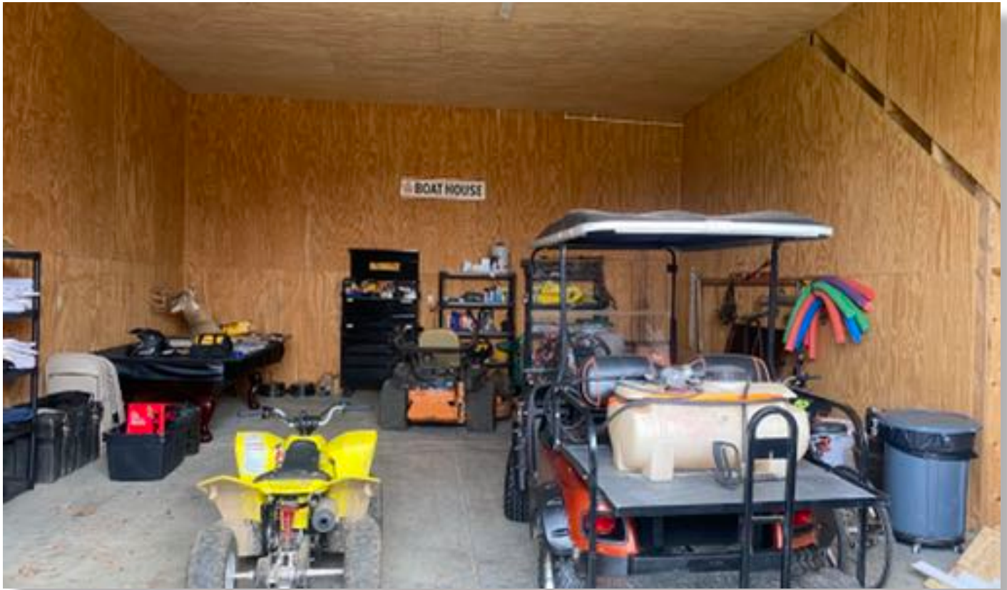
Interior of 50x50 garage with 12' overhead doors