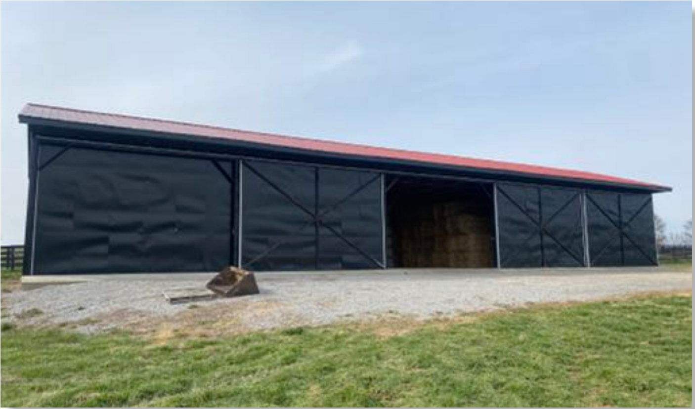
100x40 metal storage/hay barn with 14' overhead doors and concrete floor