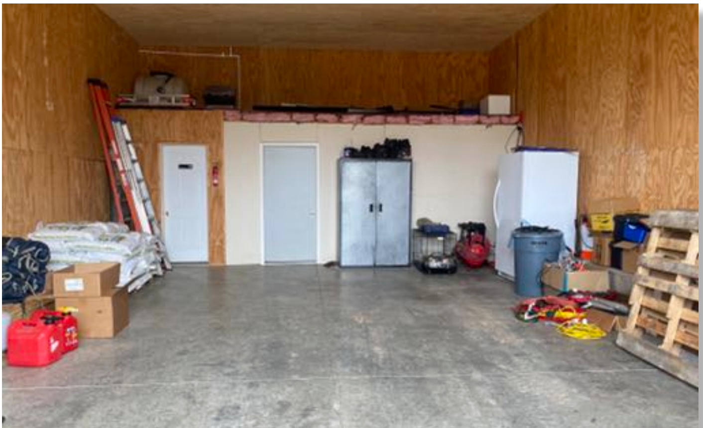
Interior of garage with bathroom facilities and laundry