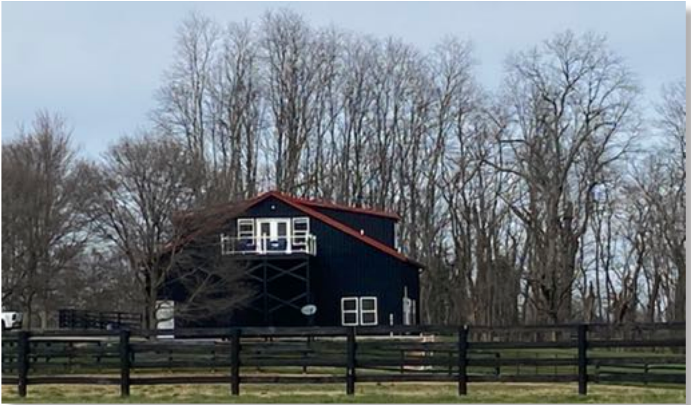
View of garage with apartments