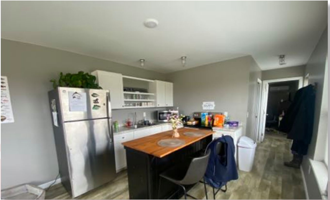
Apartment 2 - First floor