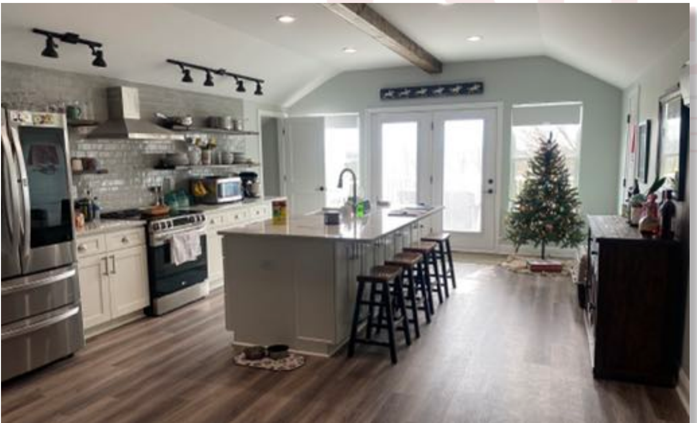
Apartment 1 - Second floor