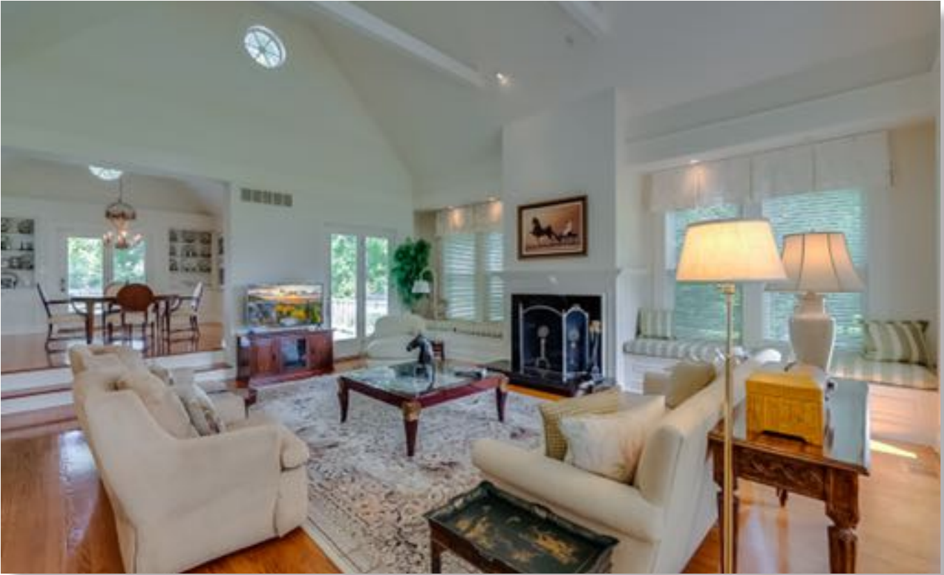
Vaulted family room with fireplace, window seats and plenty of natural light