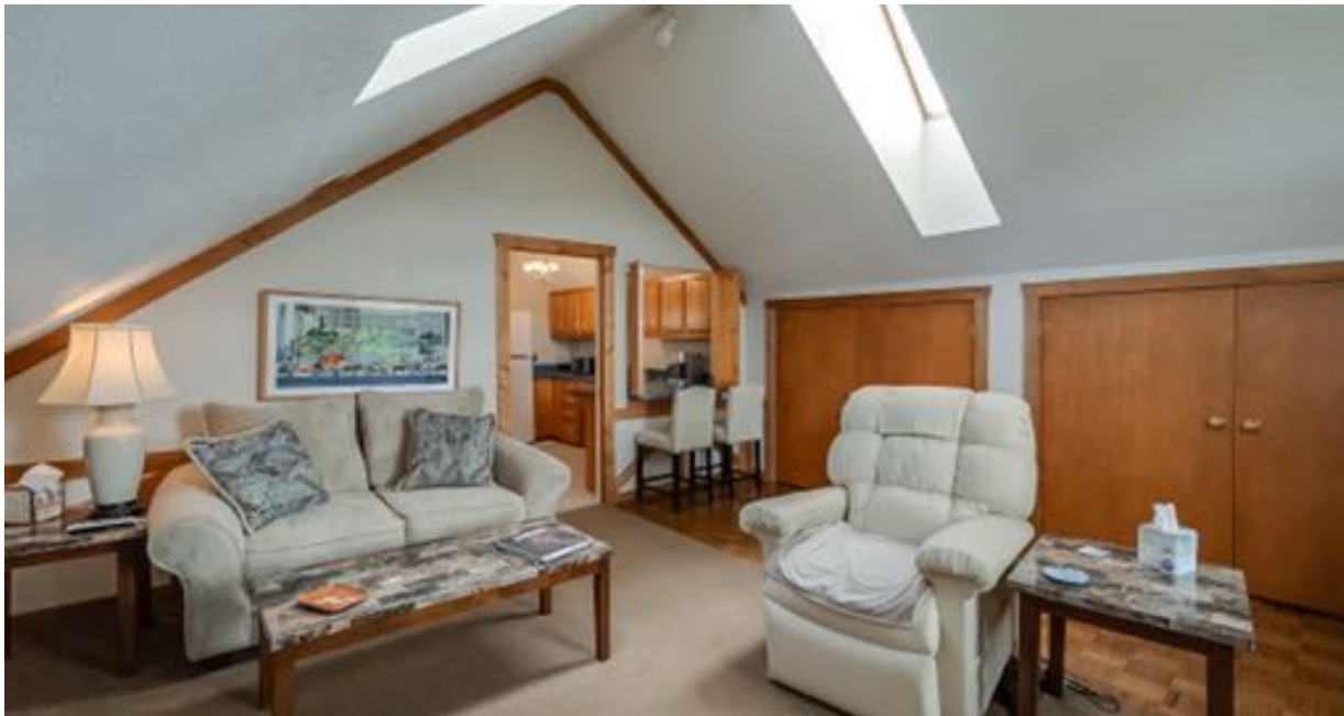
Apartment above garage with one bedroom, bath, kitchen and living area