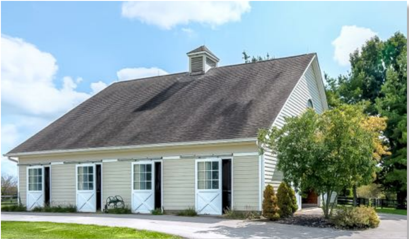
Barn with 6 stalls and brick aisleway