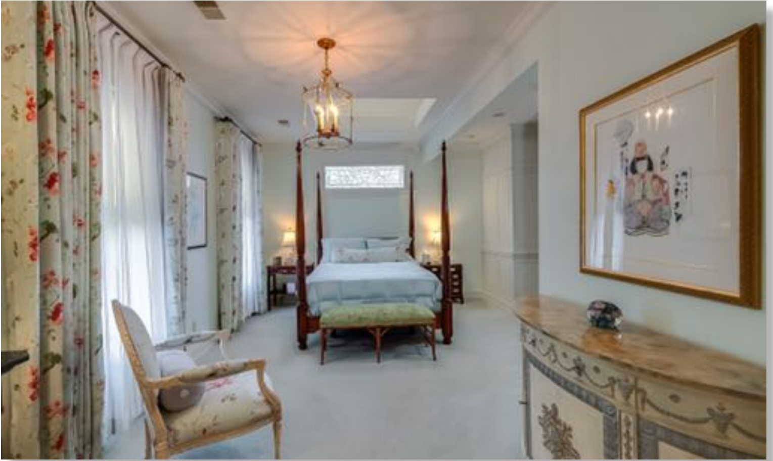
Large master suite with en suite bath with free standing soaking tub and separate shower