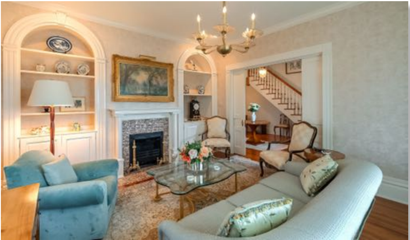
Sitting room with fireplace, built ins and crown molding