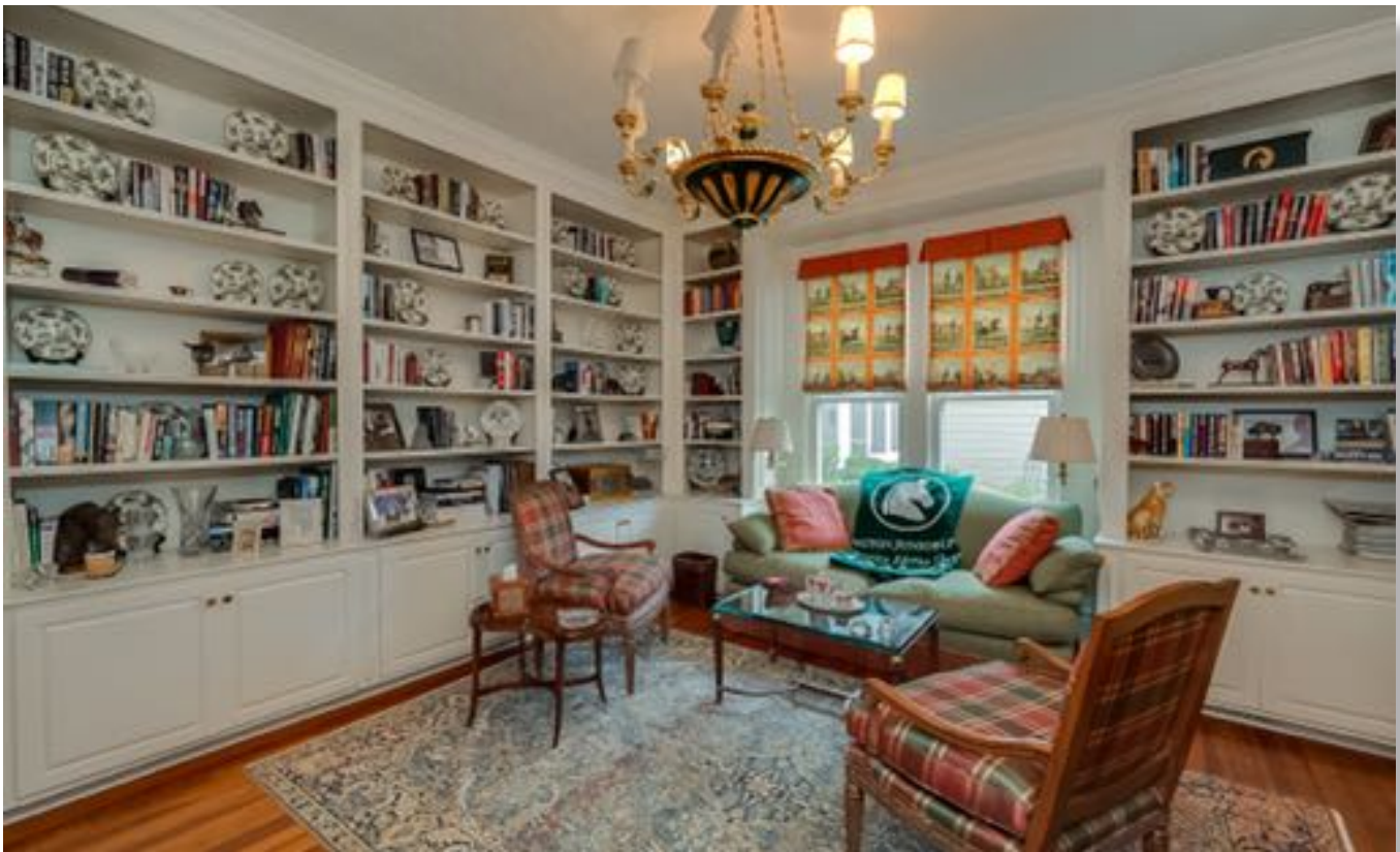
Library with built-in bookcases and fireplace (this room could also be used as a first floor bedroom suite, as there is an attached full bath and closet)