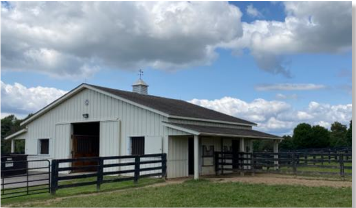
Barn with 4 stalls with doors to outside paddocks