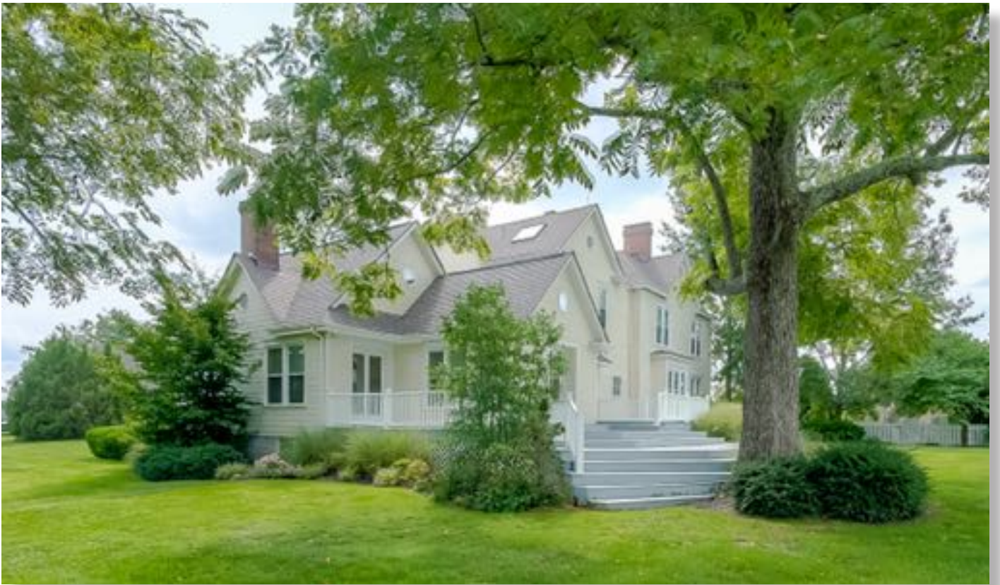
Large rear deck with beautiful views of the property