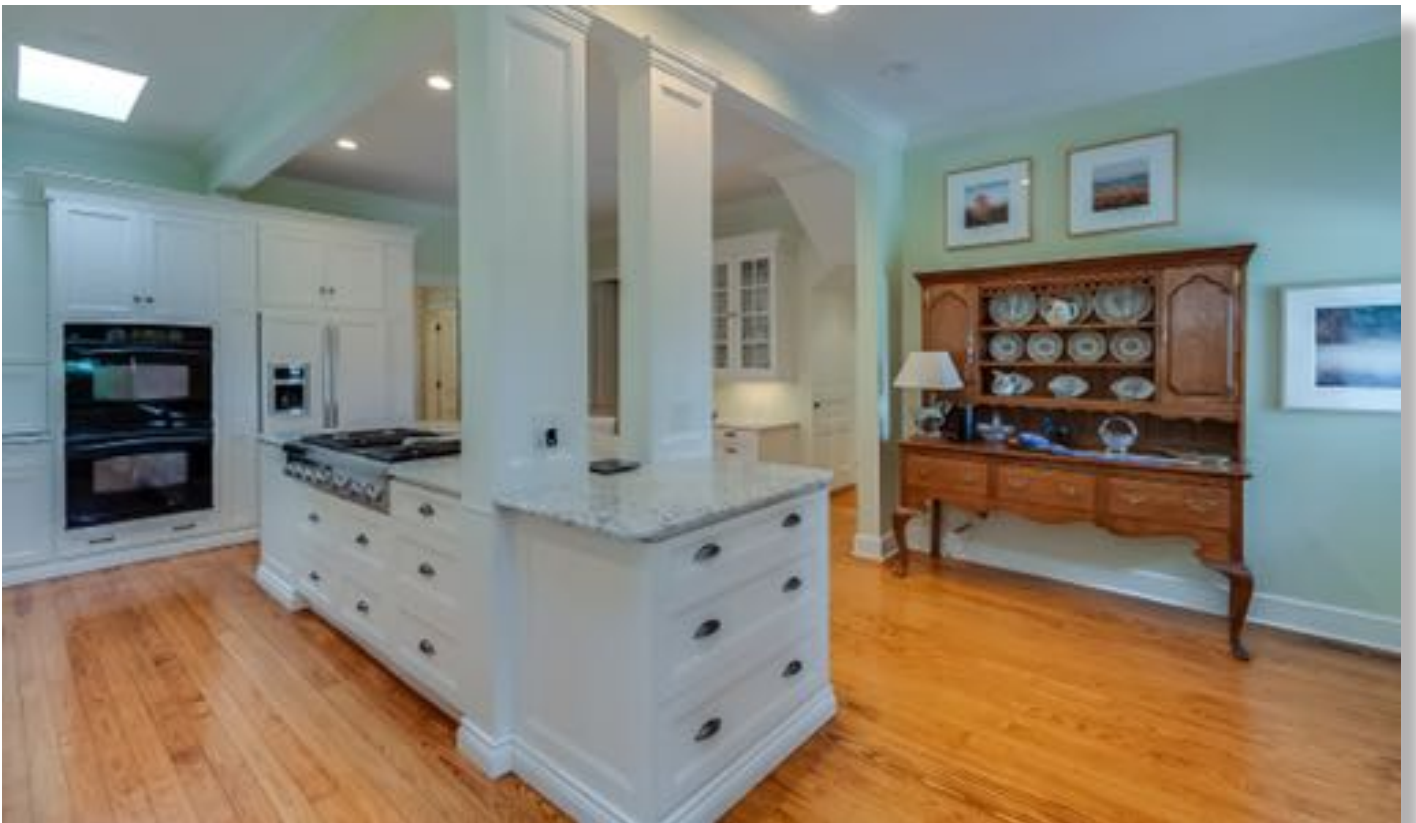
Spacious kitchen with large center island, double ovens, gas cooktop and granite countertops