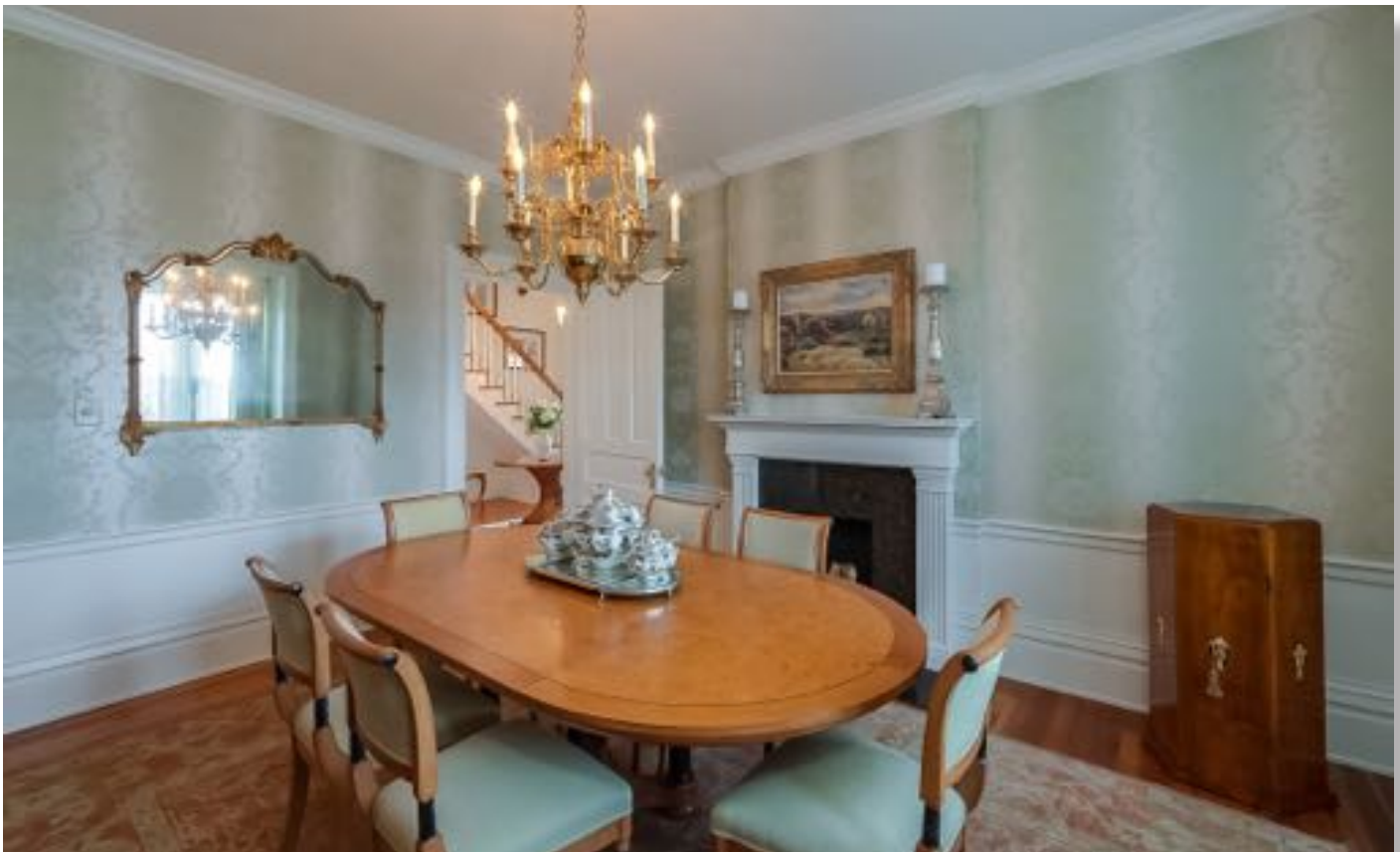
Formal dining room with fireplace