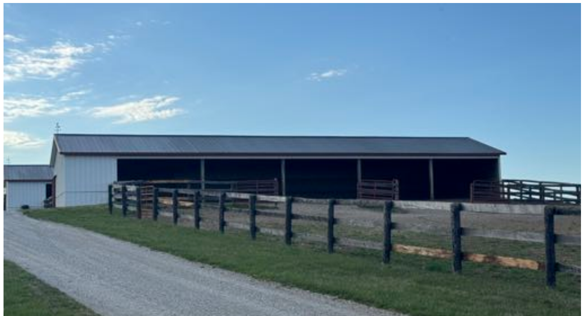
3 large run-in sheds (100' x 28')