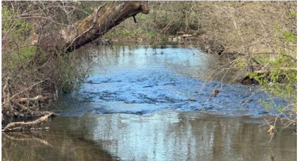
Shannon Run creek