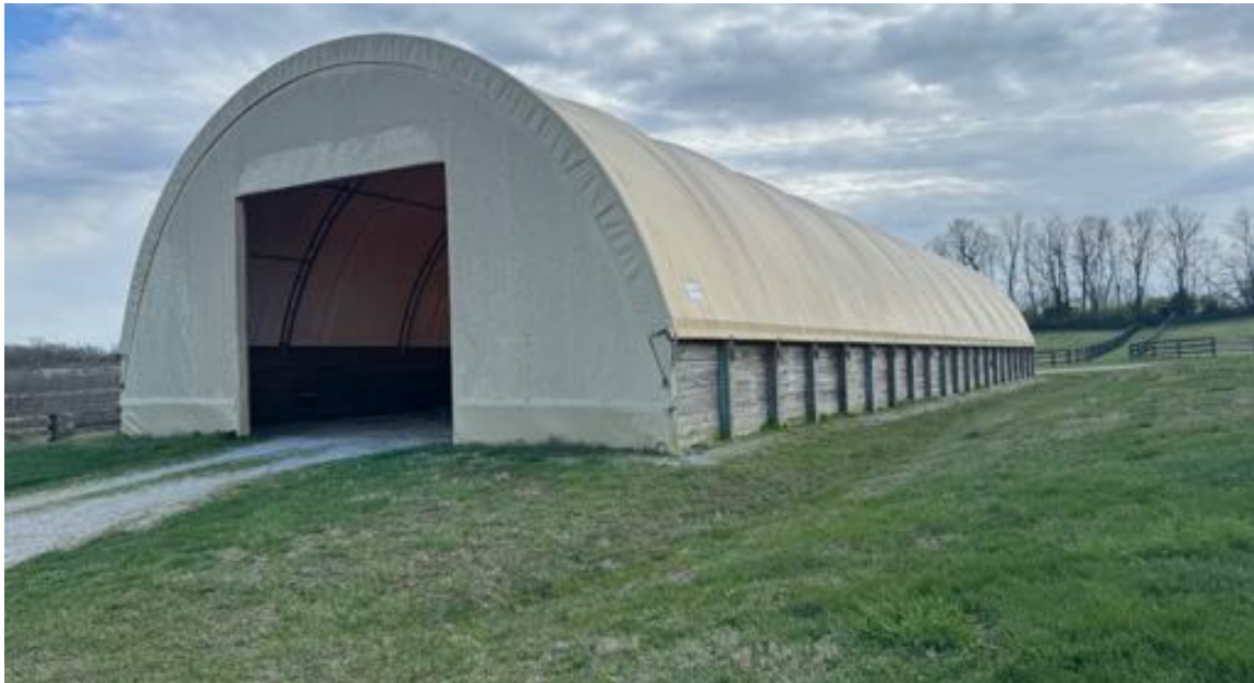
118' x 38' hay & equipment storage