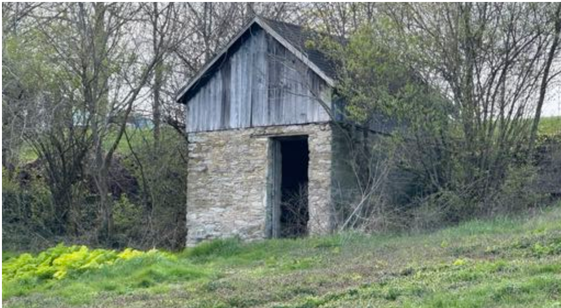
Stone spring house