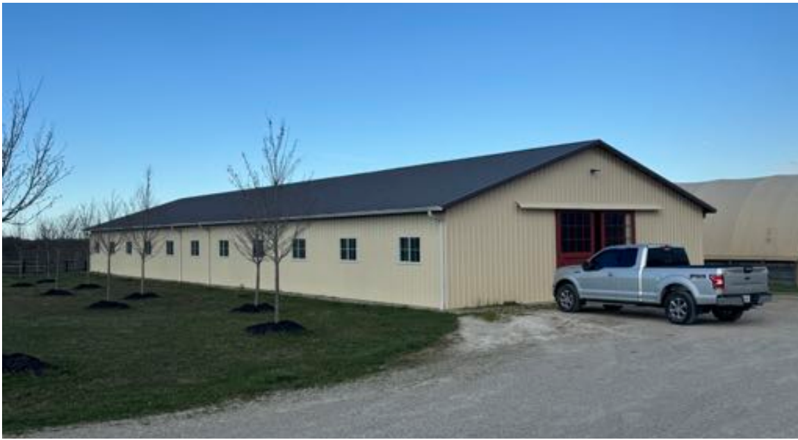
20 stall barn