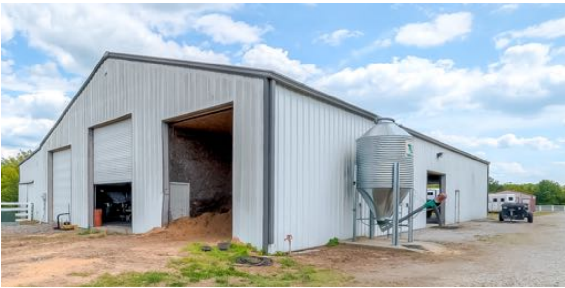
60'x100' metal storage barn with 18ft overhead doors