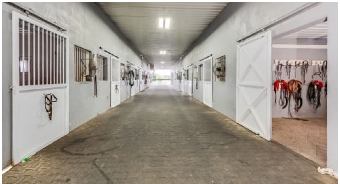
Large stalls, rubber brick aisle way and 2 tack rooms