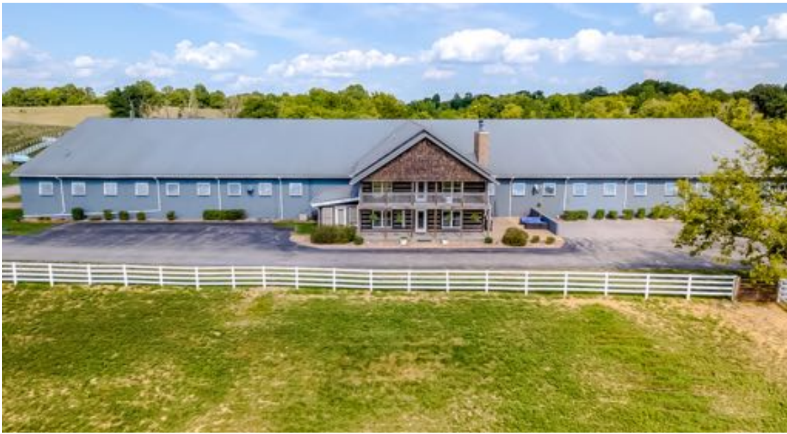
34 stall barn