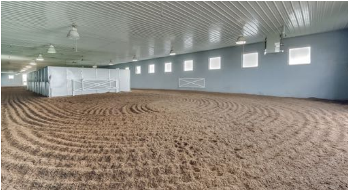
250'x50' heated indoor arena