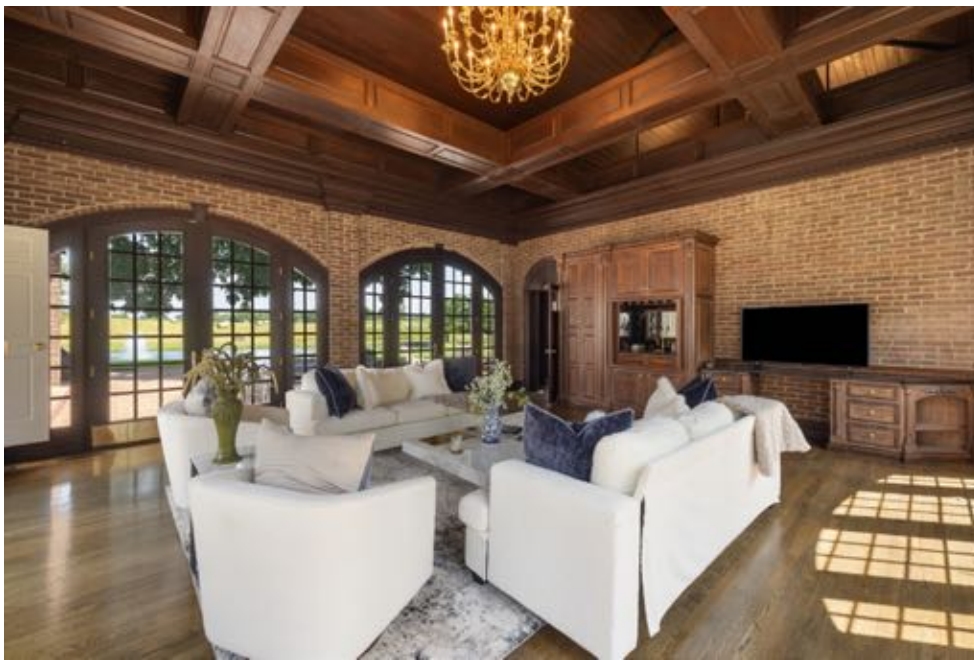
Family room with vaulted and beamed ceiling, built-in cabinetry and wet bar