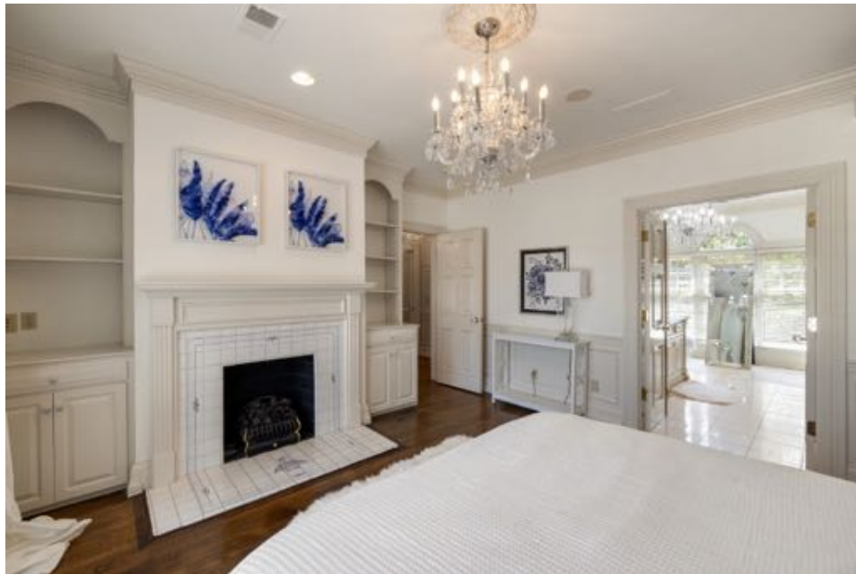
Second floor guest bedrooms