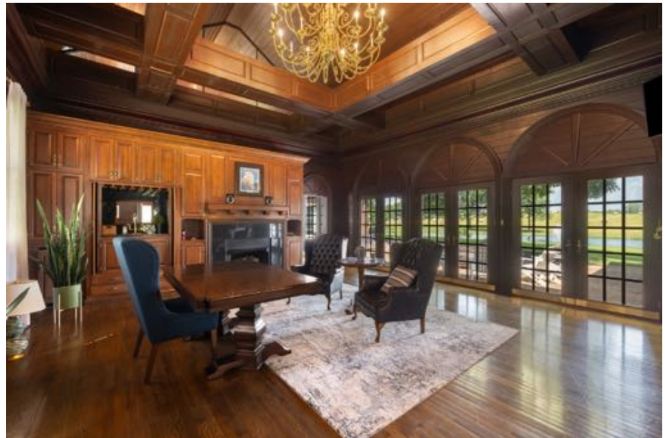
Executive office with wet bar and fireplace