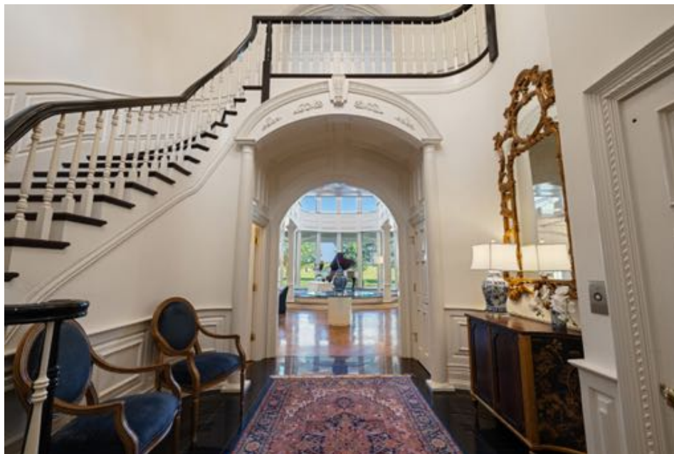
Entrance foyer with elevator and powder room