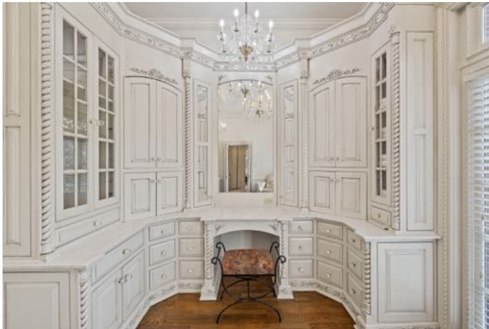
Vanity room with intricately trimmed built-in cabinetry