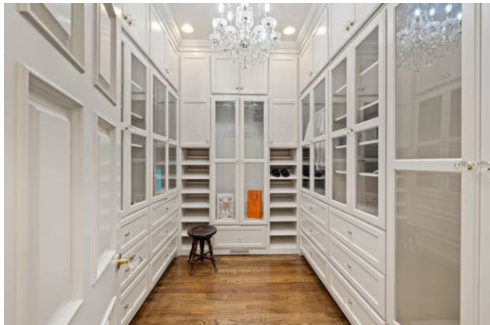
Ample closet space