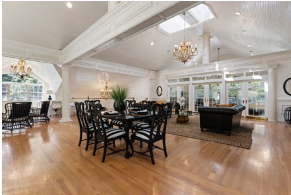
Lounge and guest quarters