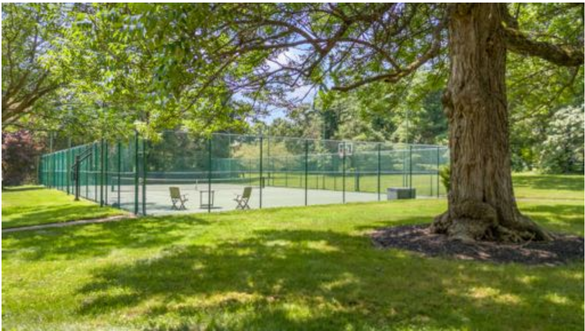
Tennis and basketball court