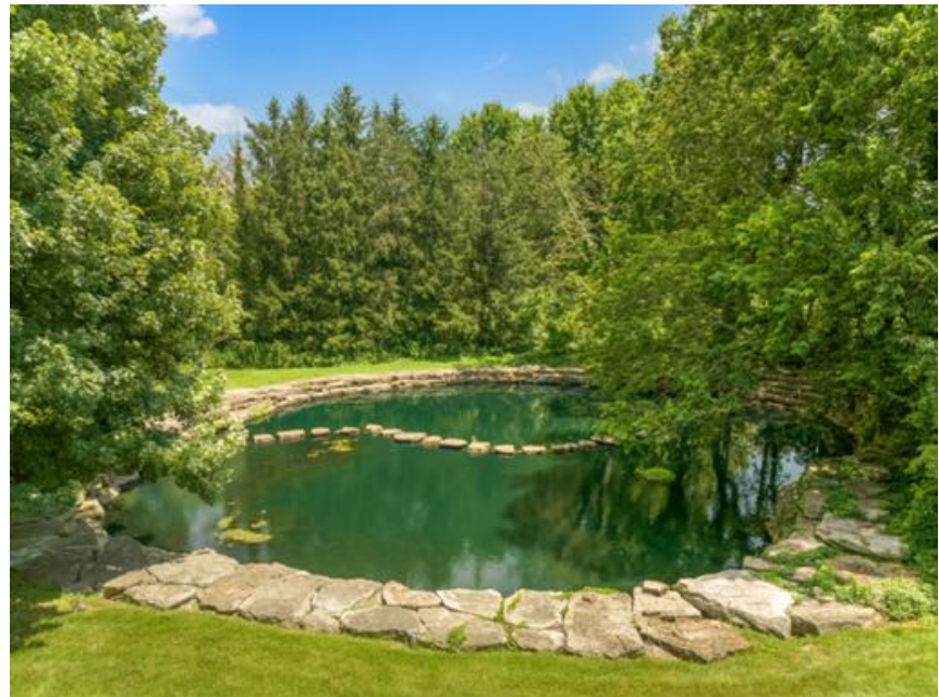
Spring fed pond