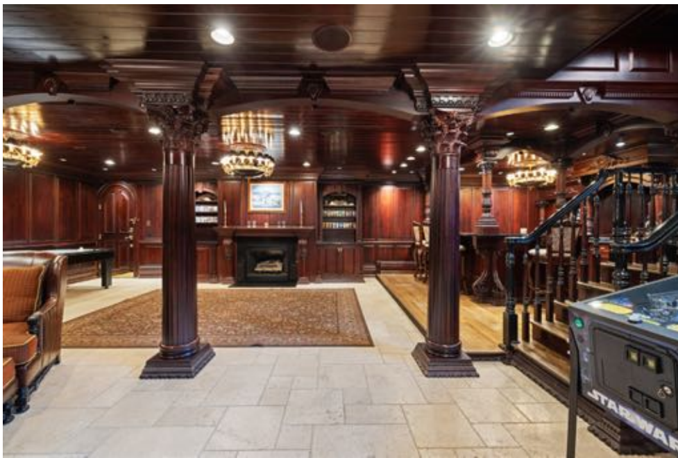
Basement gameroom/ den