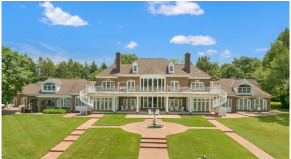
17,000 sqft stunning main residence