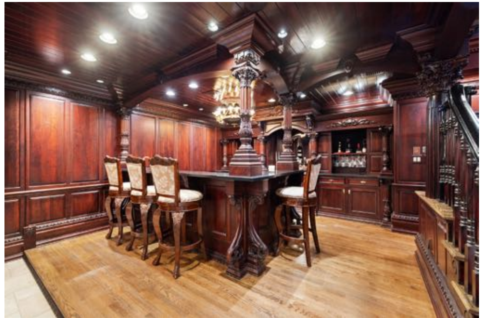
Full bar with ornate detail