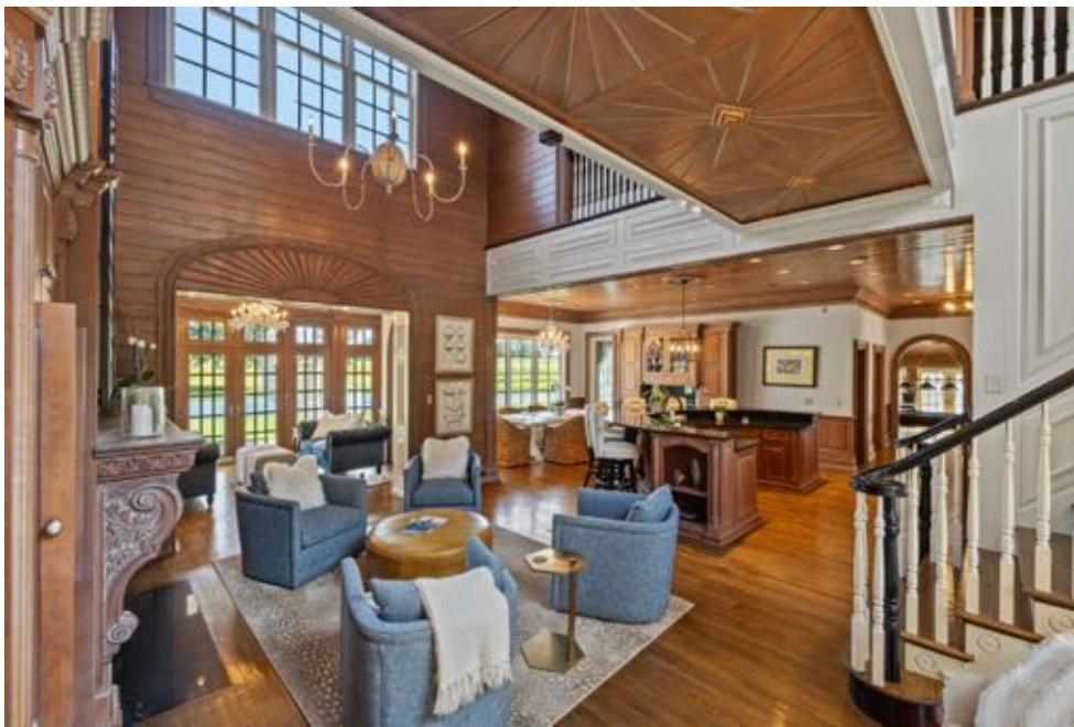
Living room with fireplace, coffee bar and wood paneling throughout