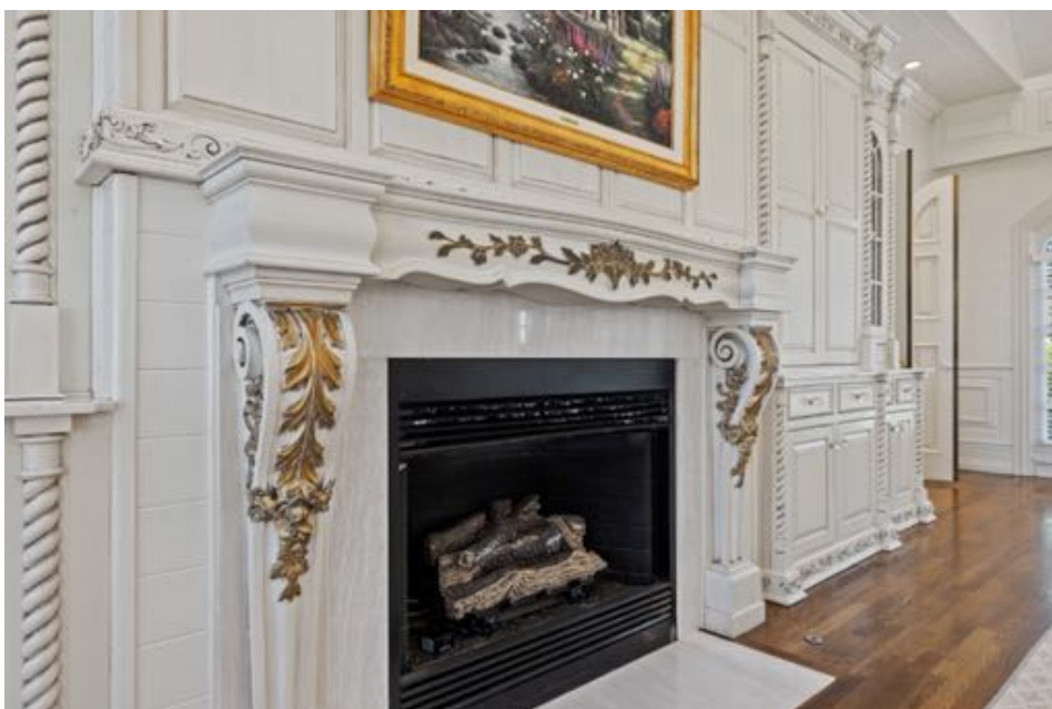
Marble fireplace with opulent mantle