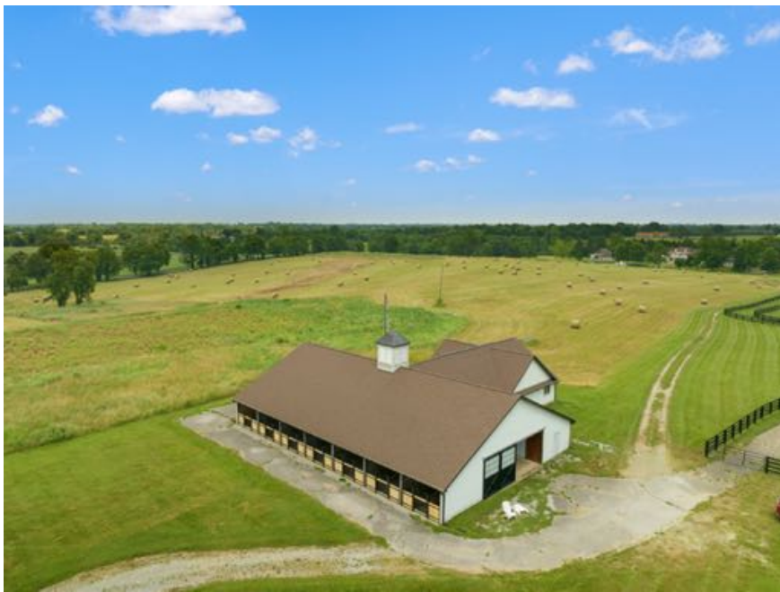
Large 18 stall barn with 7 shedrow stalls and opportunity to finish roughed in living space