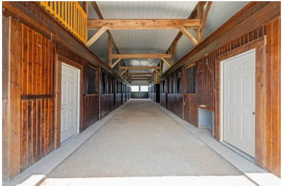
11 interior stalls, tack room and feed room