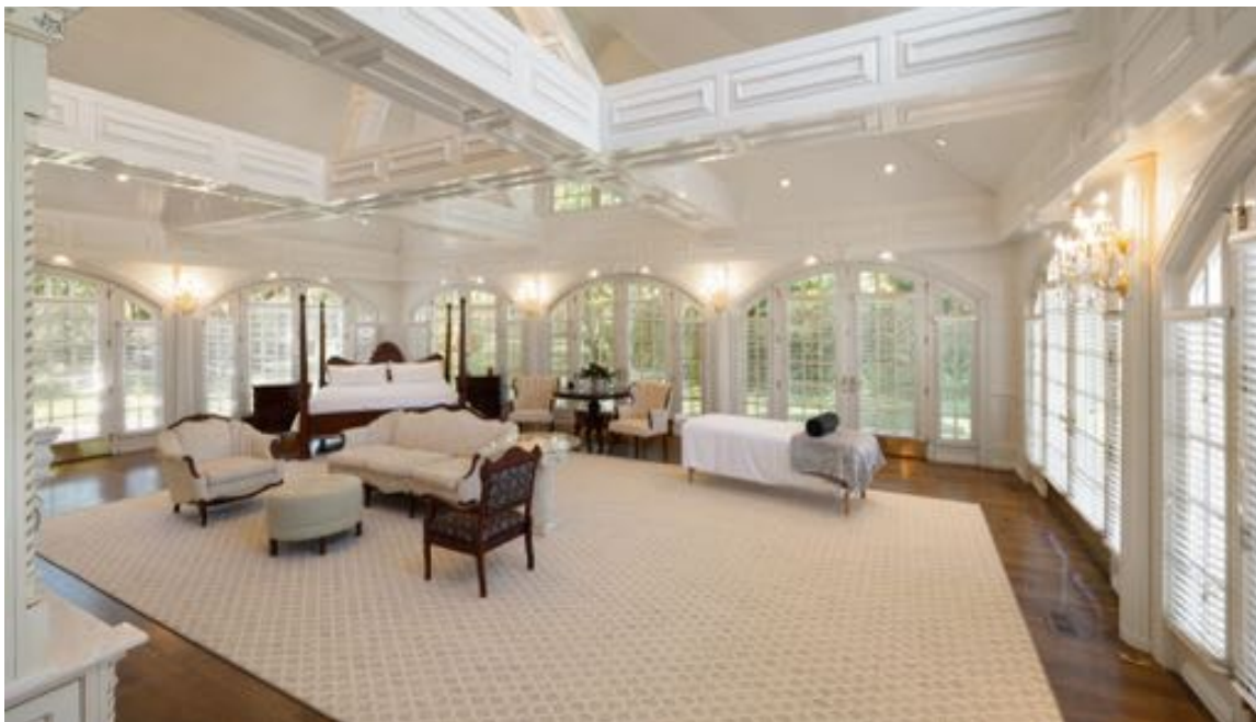
Vaulted and beamed ceiling, French doors, large windows and plenty of natural light