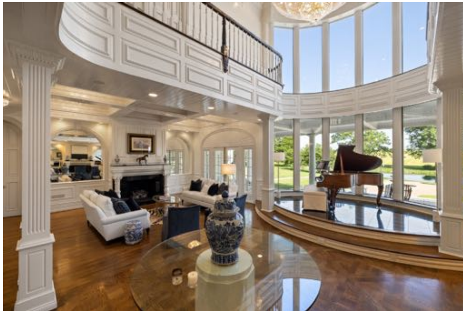
Floor to ceiling windows and parquet hardwood flooring