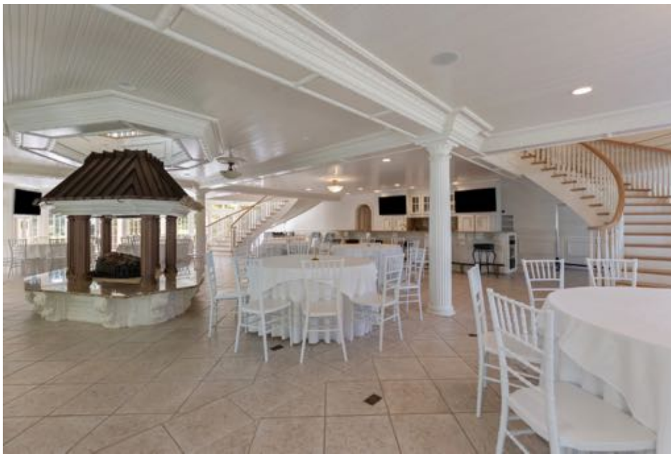
Large entertaining area with indoor firepit