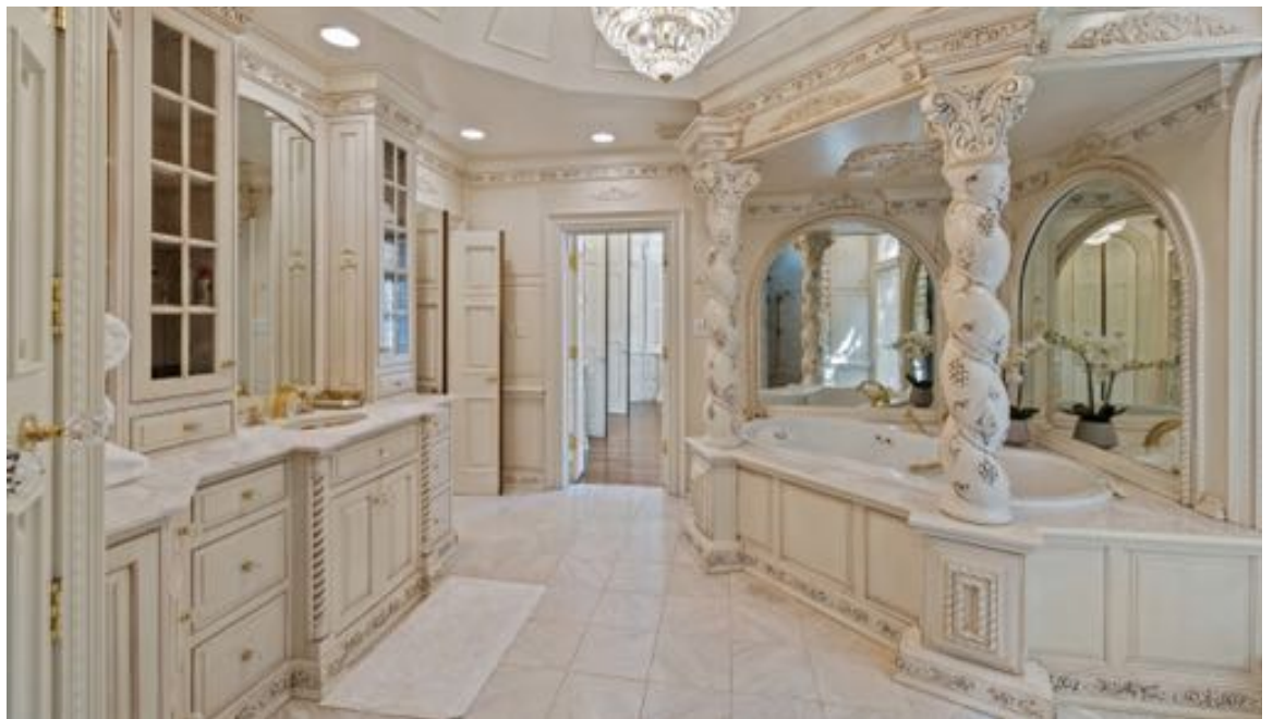
Primary bathroom suite