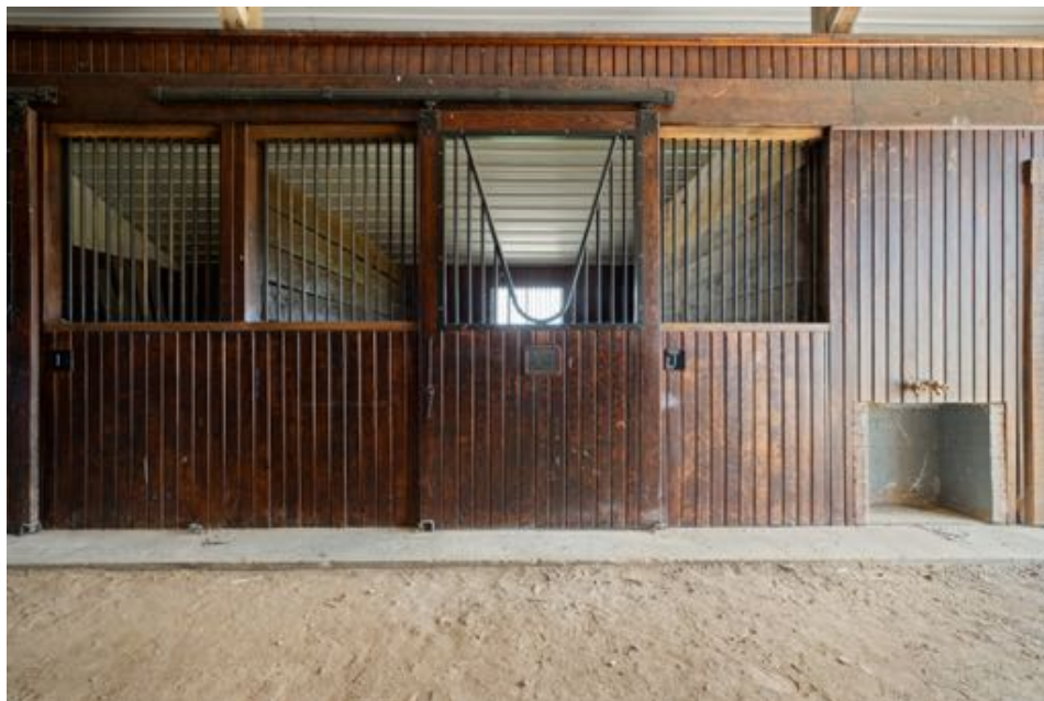
Tongue and groove pine stall fronts with yolk