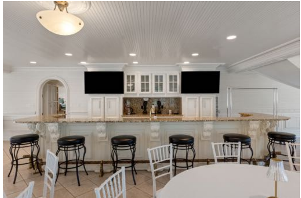
Full bar and kitchen