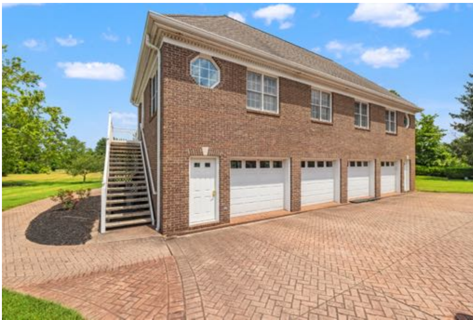
4 car garage with upstairs guest apartment