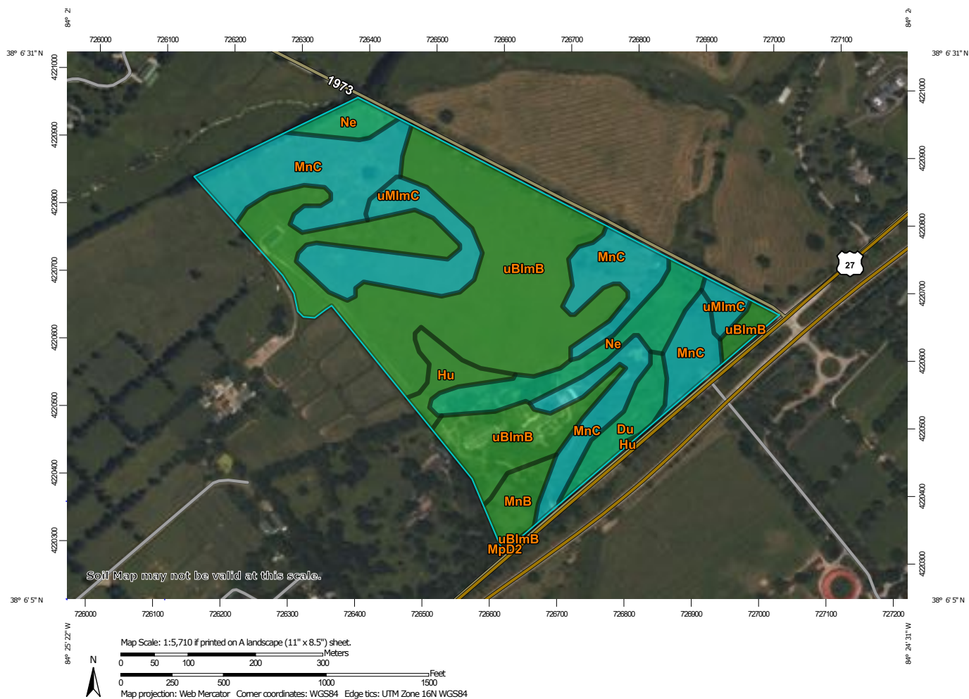
Farmland Classification—Fayette County Area, Part of Fayette County, Kentucky