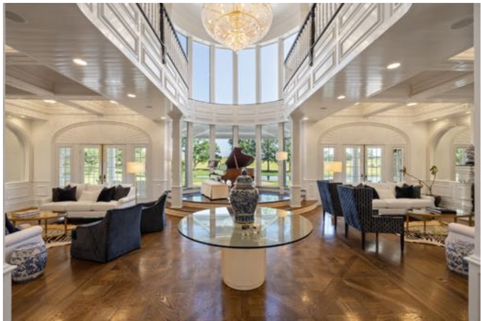
Grand foyer with ornate chandelier and balconies