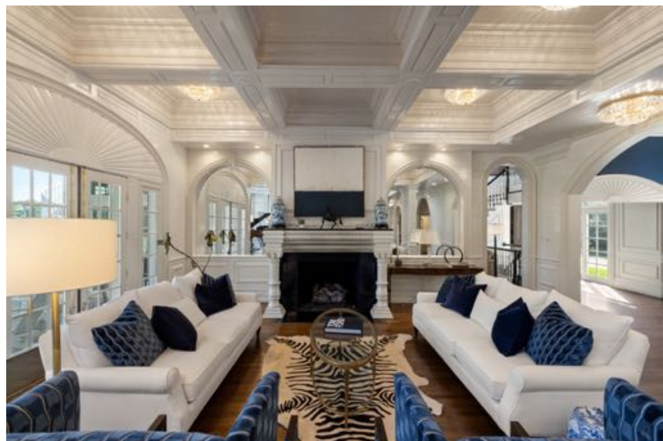
Wood paneled coffered ceilings and dual fireplaces