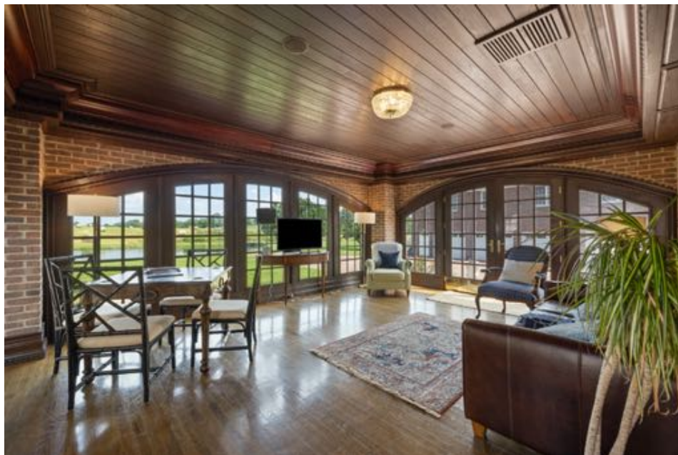
Sun room or guest lounge with exposed brick walls