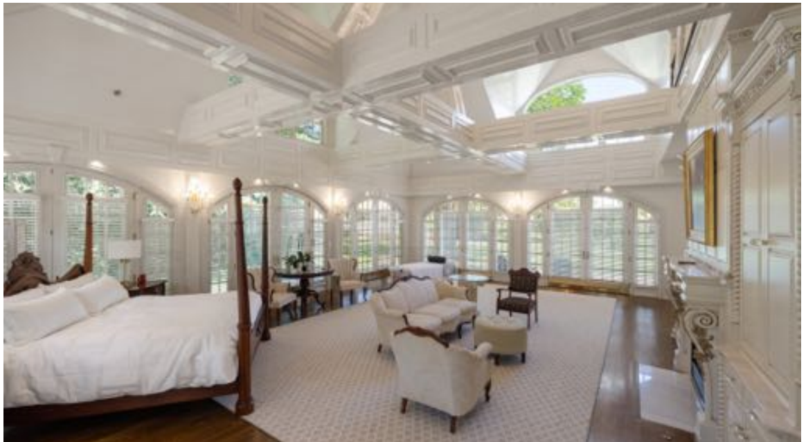
Expansive primary bedroom with fireplace