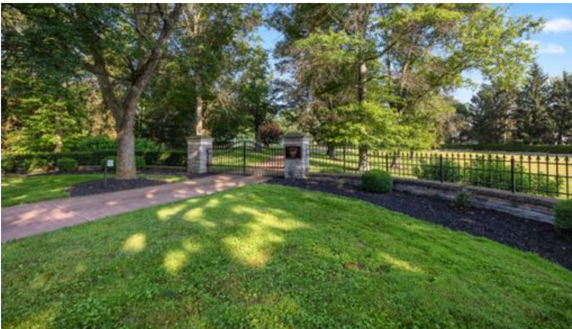
Automatic security gate