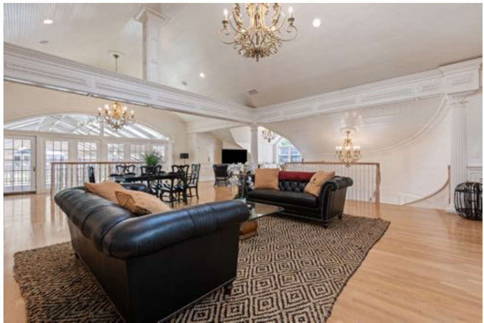
2nd floor guest lounge with balcony overlooking pool