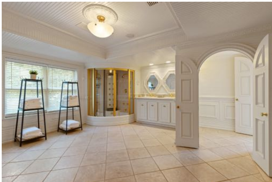
Men's and Women's full bathrooms