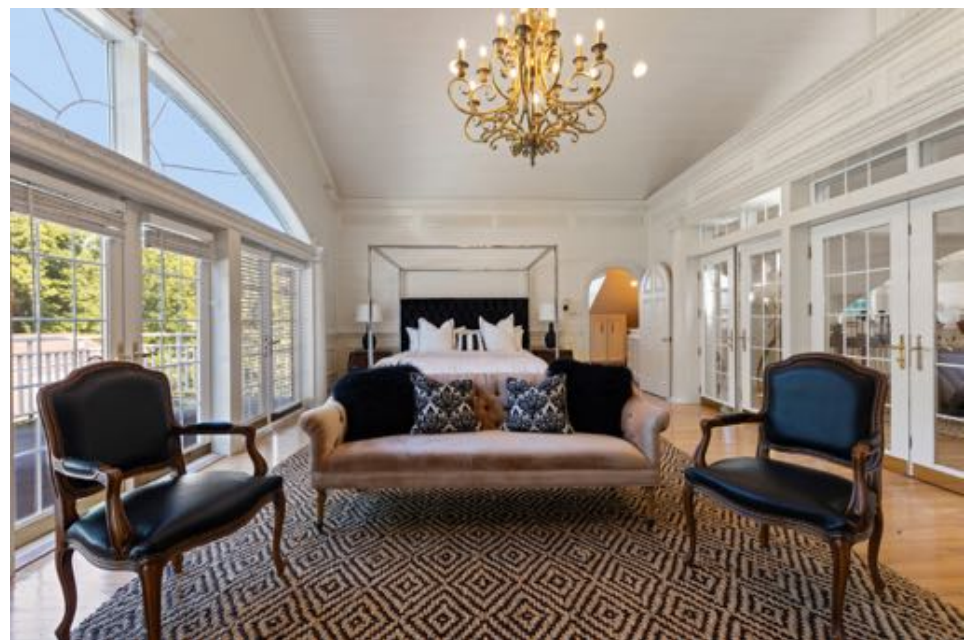
Guest room with outdoor balcony