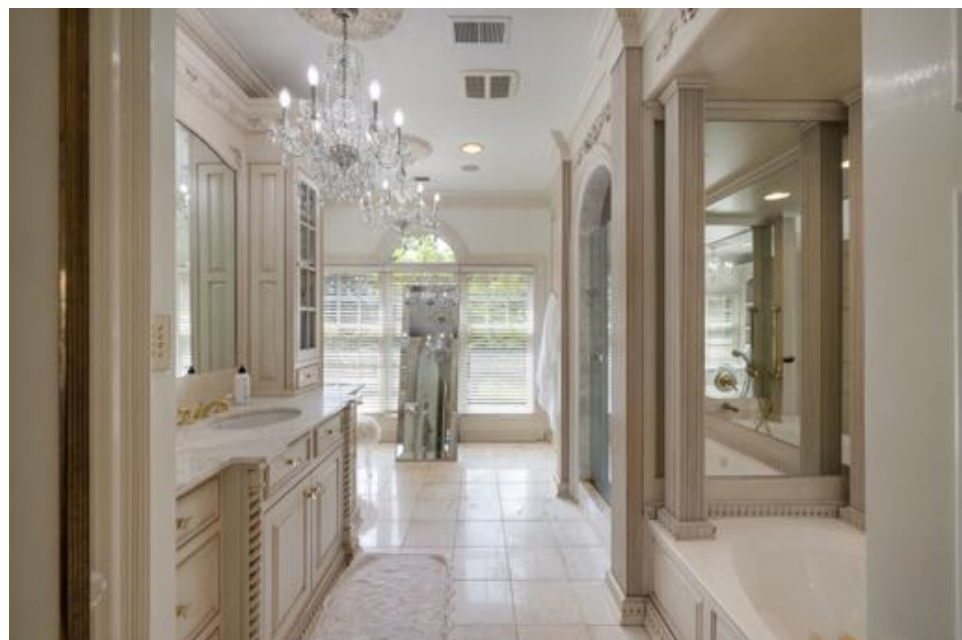
En suite bathroom with walk-in shower and soaking tub