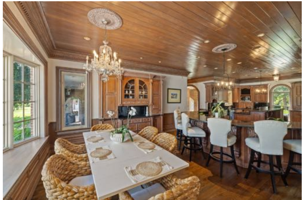
Kitchen with eat-in area and large bay window