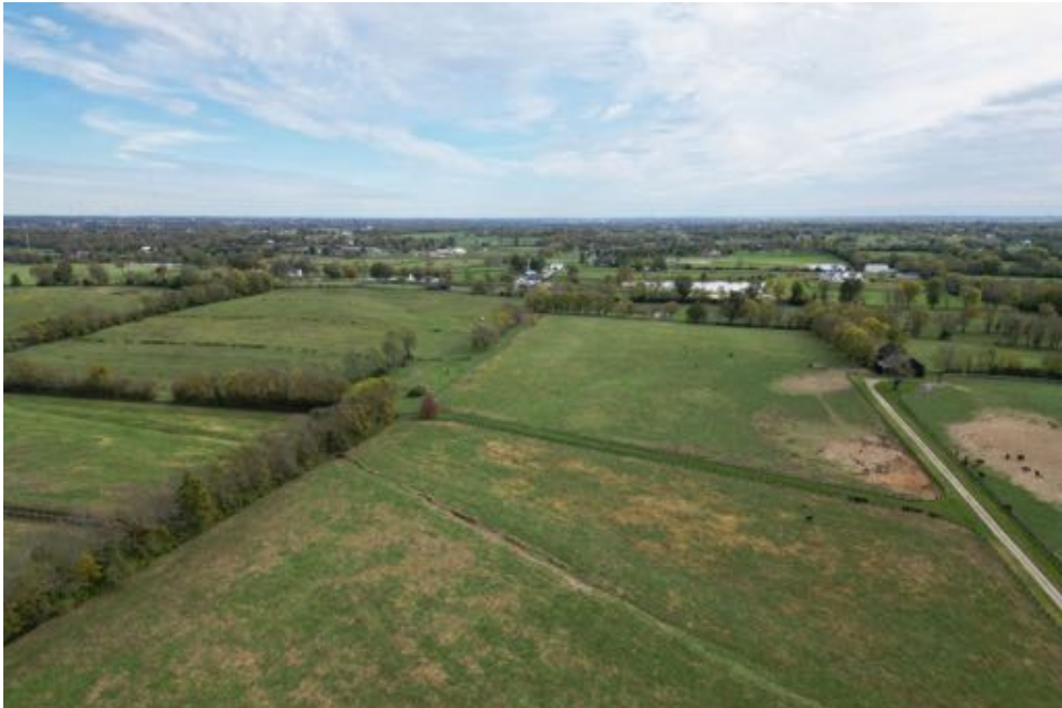
Level to gently rolling fields