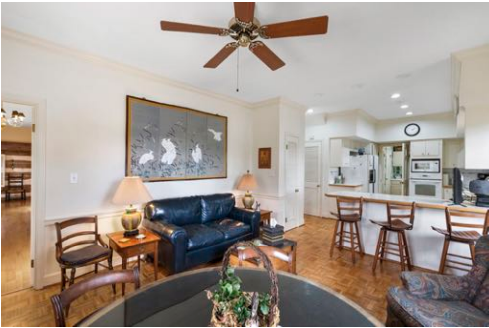
Family Room opens to Kitchen