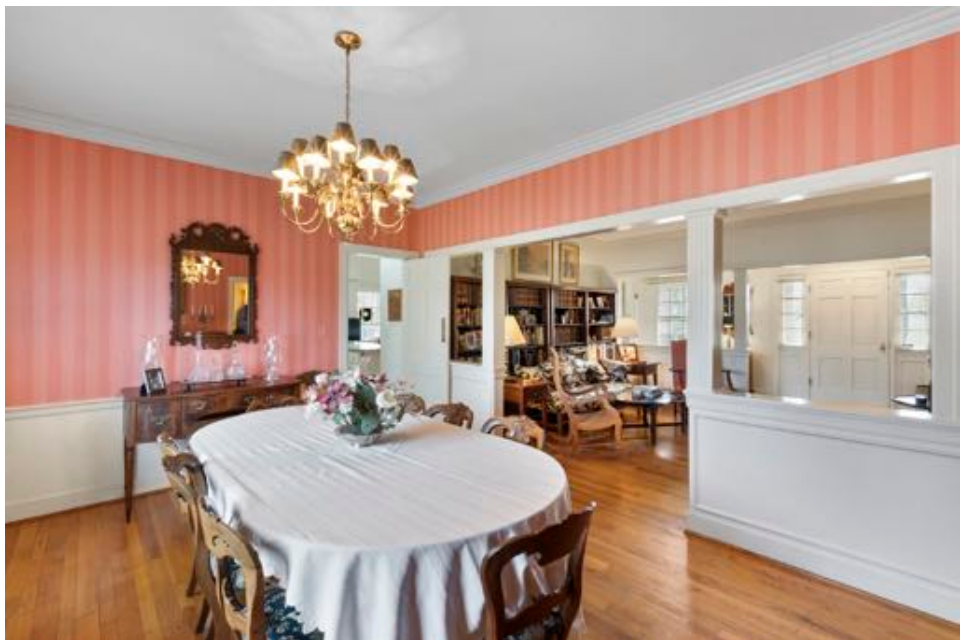
Dining Room with crown molding, wainscoting and chandelier