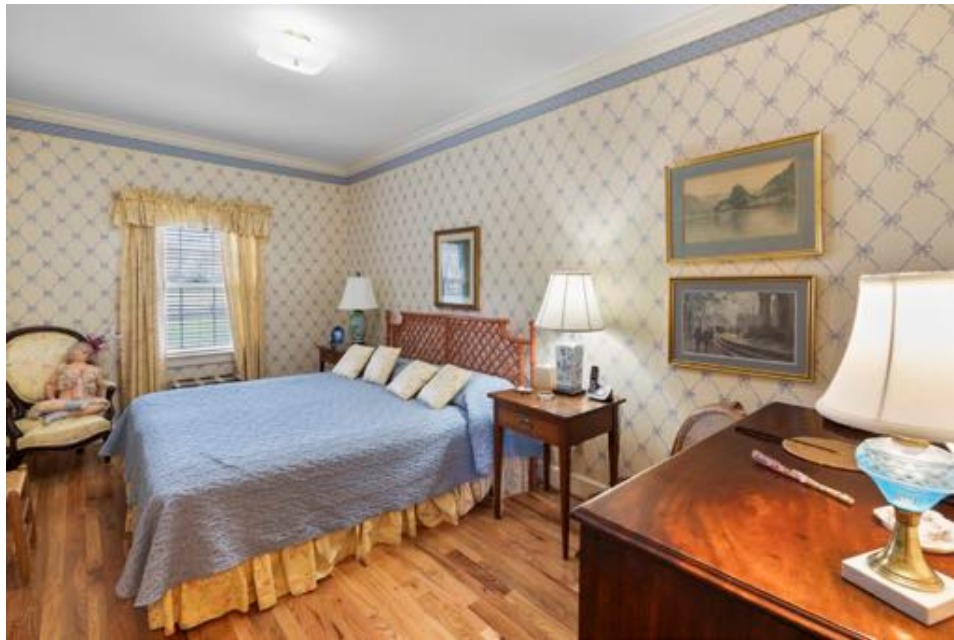
1st floor Bedroom