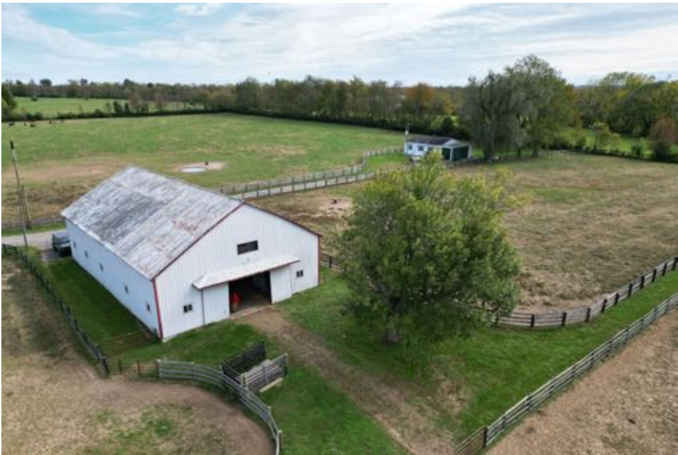
10 stall barn with employee residence