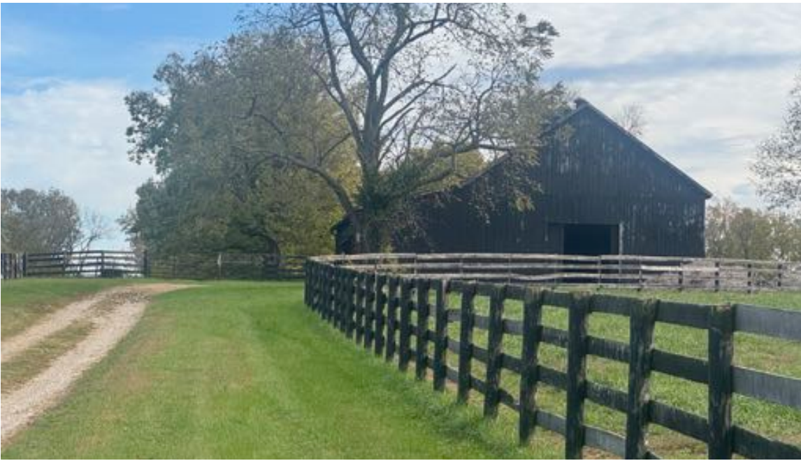
Another view of 10 bent tobacco barn