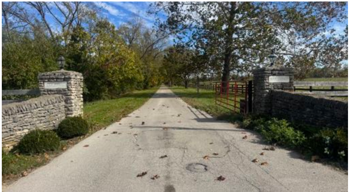
Stone gated entrance and paved roadway