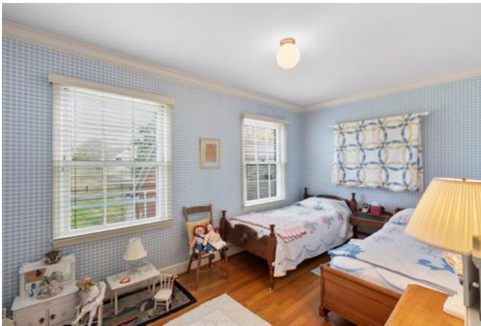
2nd floor Bedroom