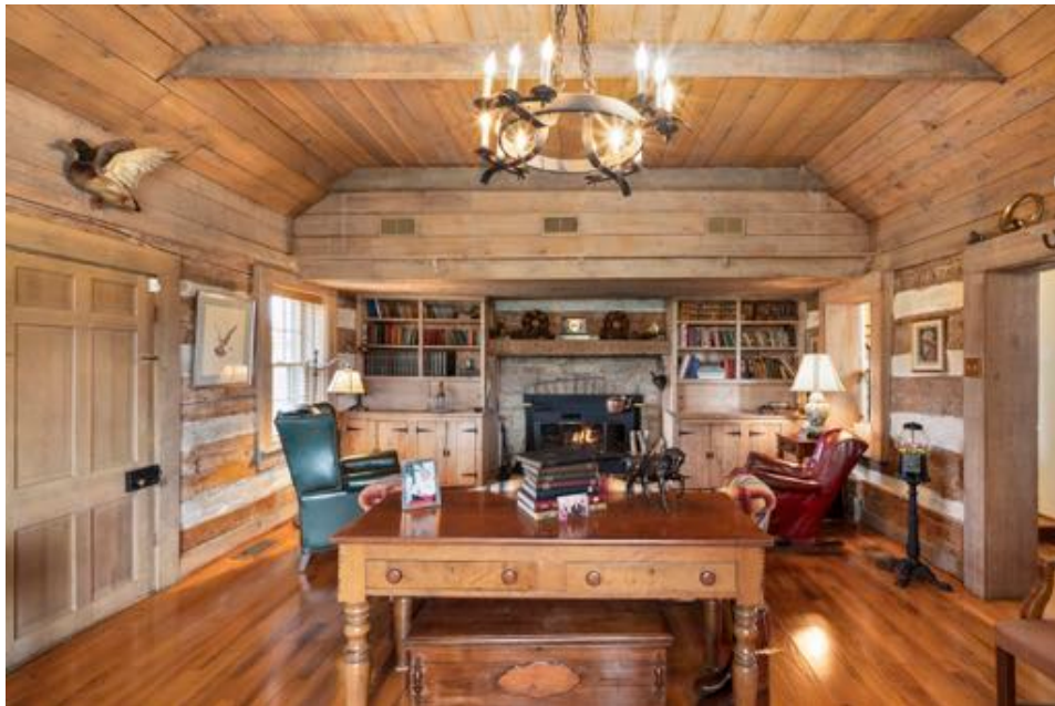
Beautiful log cabin room with stone fireplace and wood beams Circa 1825