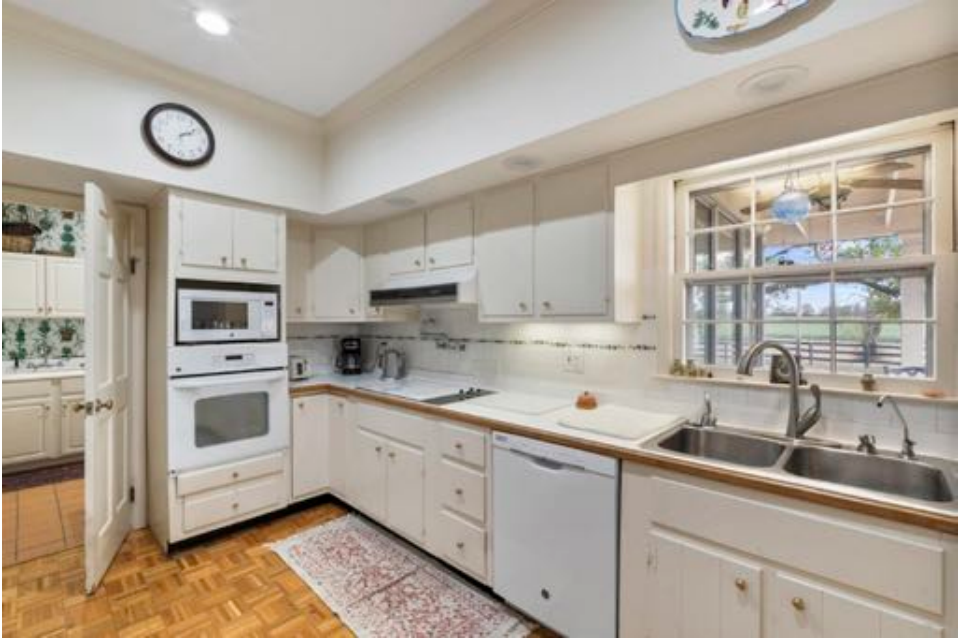
Kitchen with tile backsplash and breakfast bar