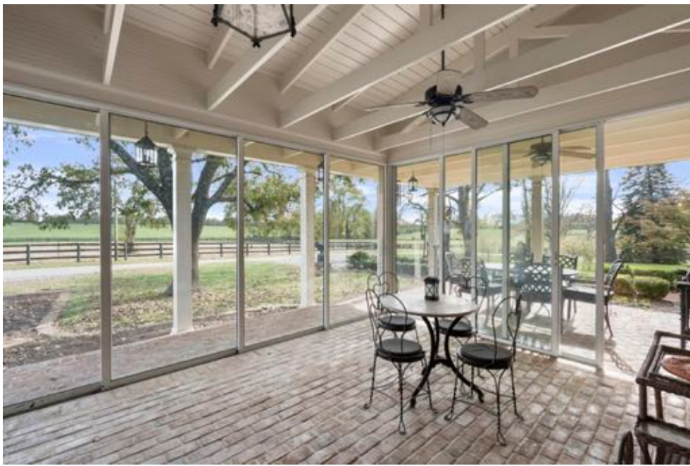
Sliding door patio with ceiling fan, beam ceiling and brick floor