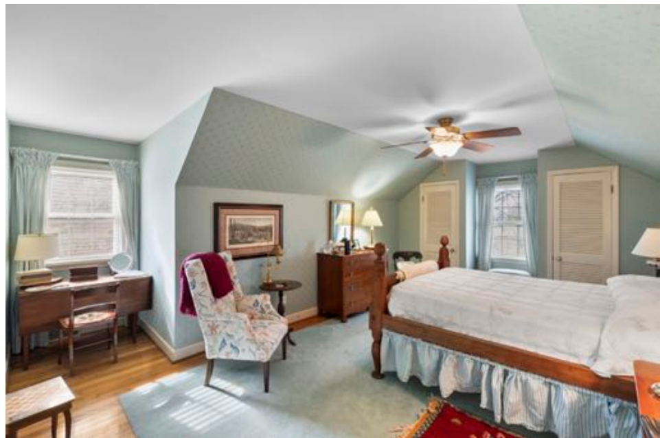
Charming 2nd floor Bedroom