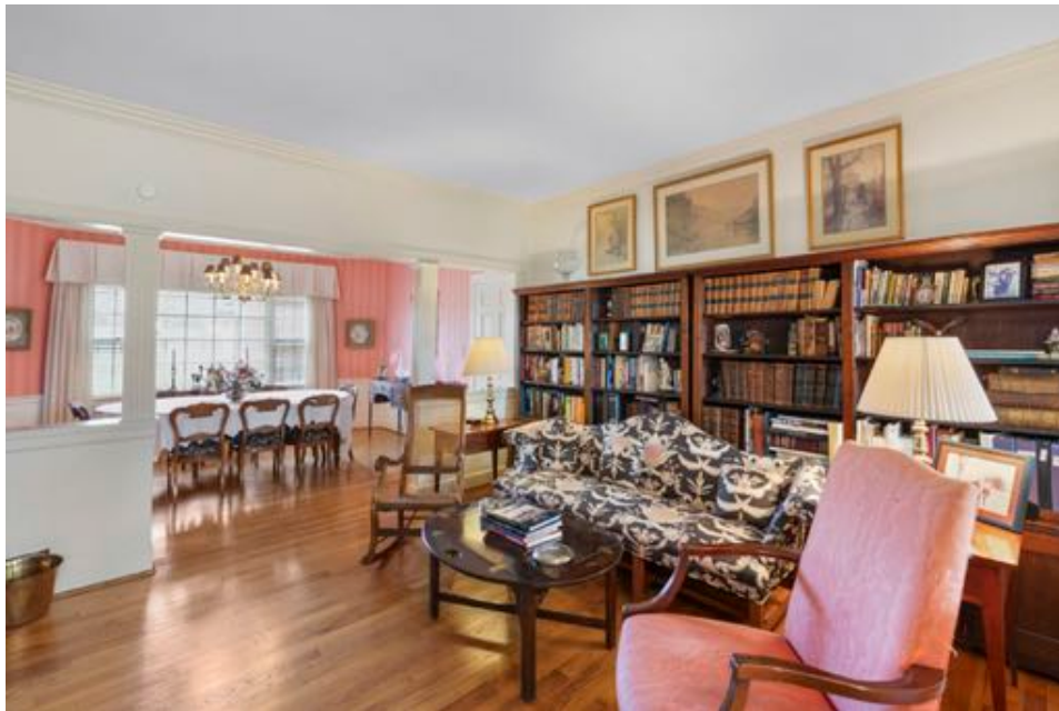
Open Formal Living Room