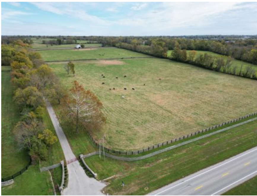
Gated entry from Newtown Pike