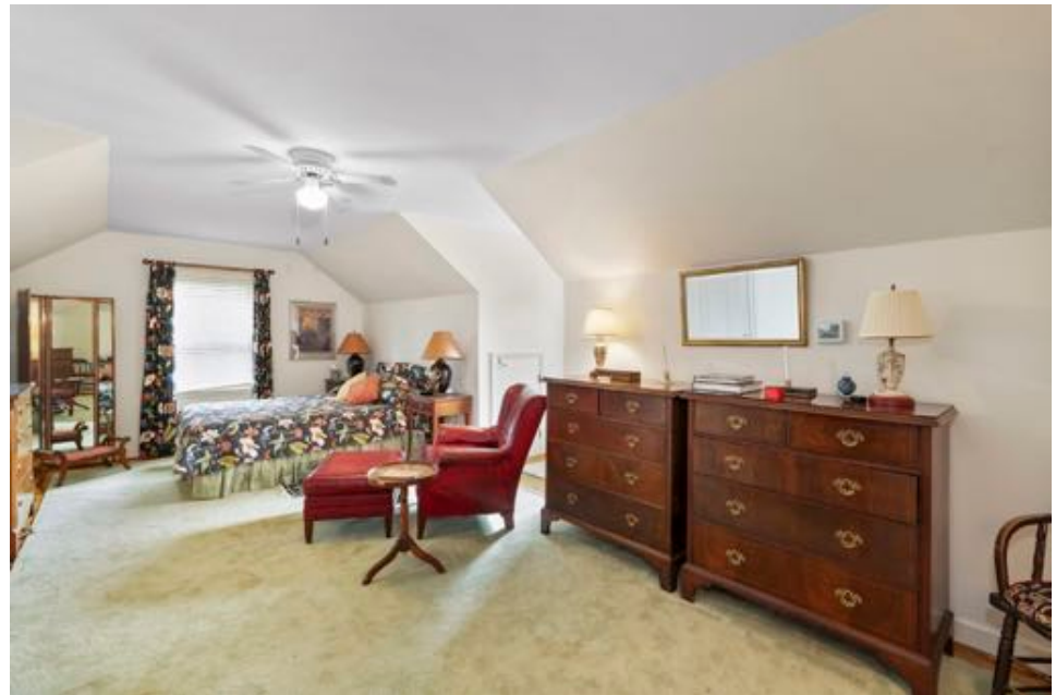
Spacious 2nd floor Bedroom