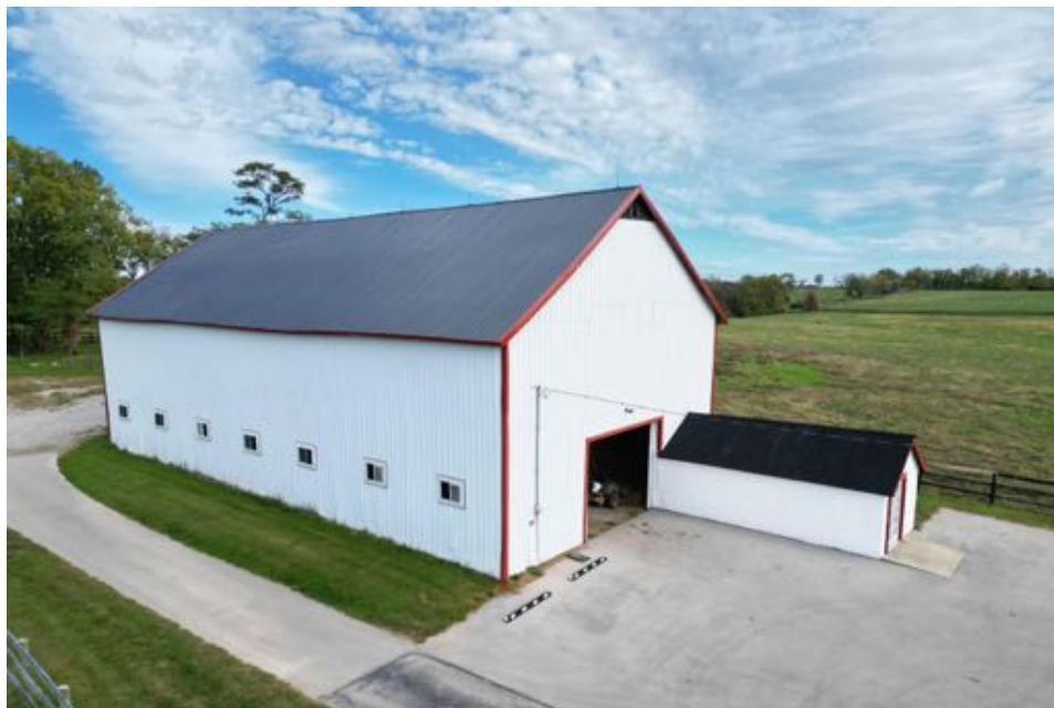
Hay barn with 10 stalls