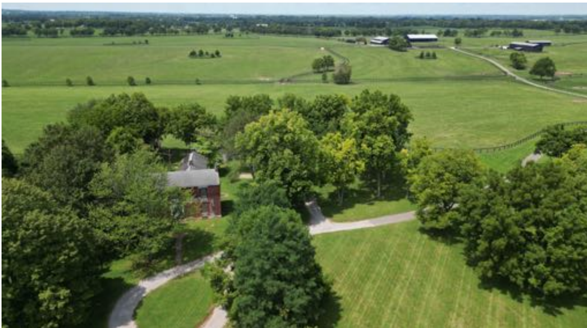
Historic residence in need of renovation