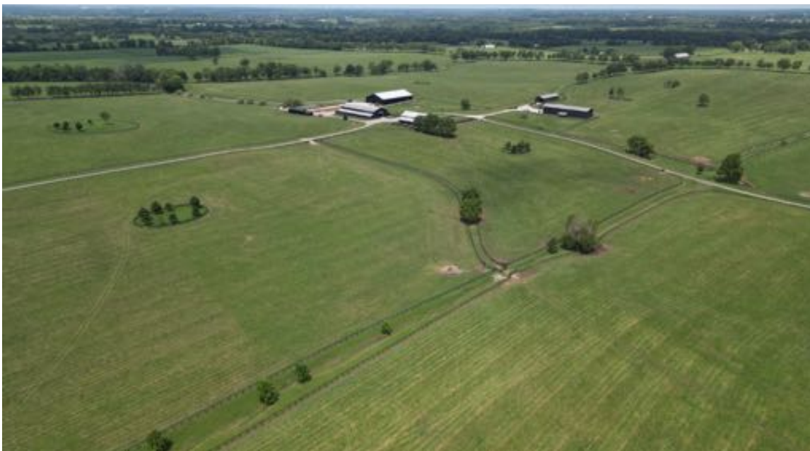
More than 9 large fields and 5 paddocks