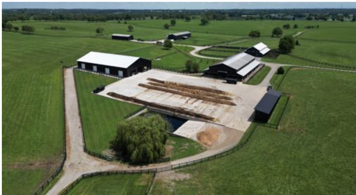
Large concrete pad and retention for compost operations