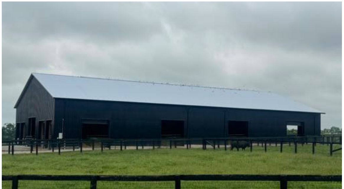
Another view of the new 84x145 cattle penned feed barn