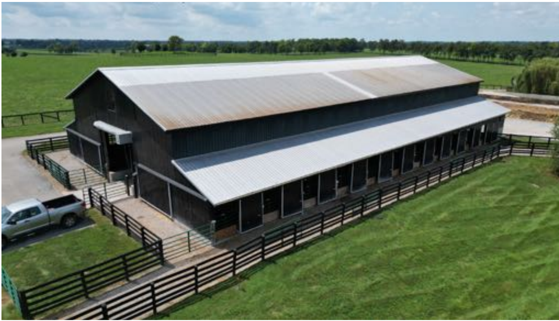
145x80 barn with cattle pens and center aisle