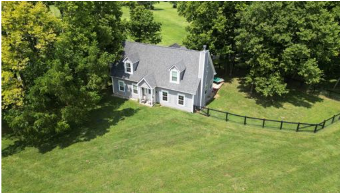
Two identical 3 BR 2 BA employee residences