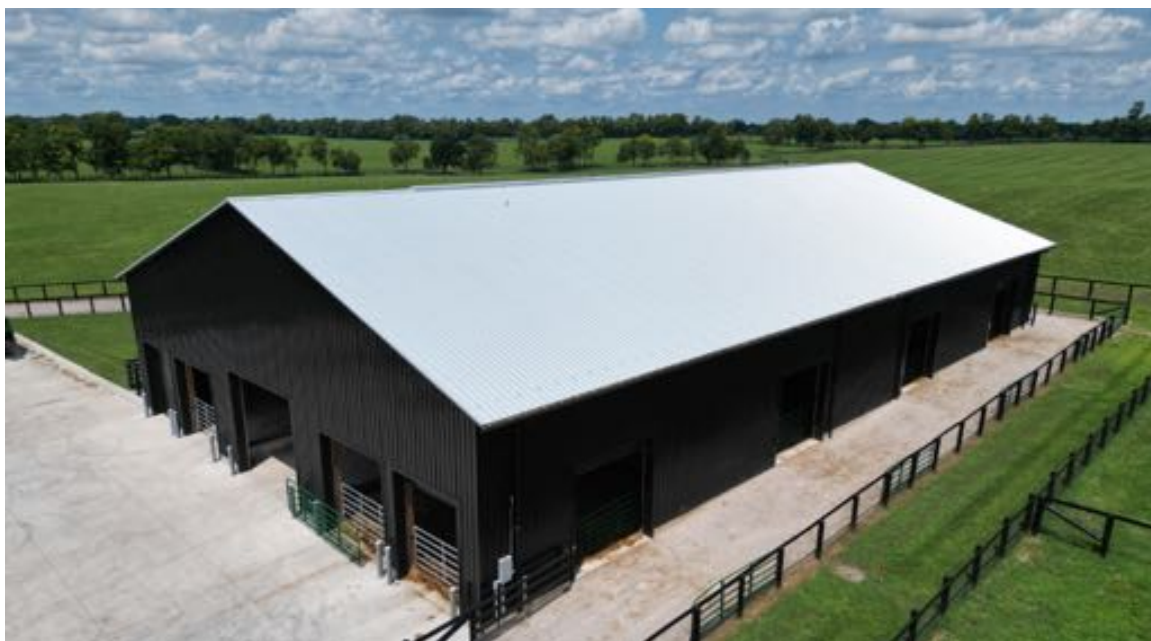
84x145 cattle penned feed barn with 18' aisle, 16' roll up door and 14' roll up doors around the exterior