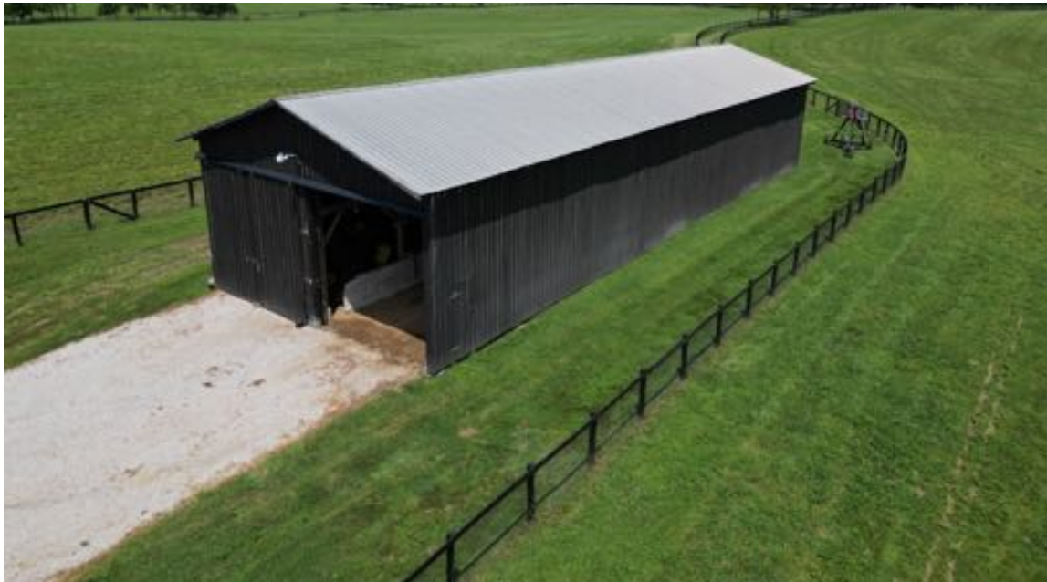
31x94 hay and equipment storage barn