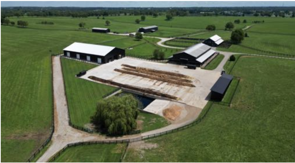
Large concrete pad and retention for compost operations