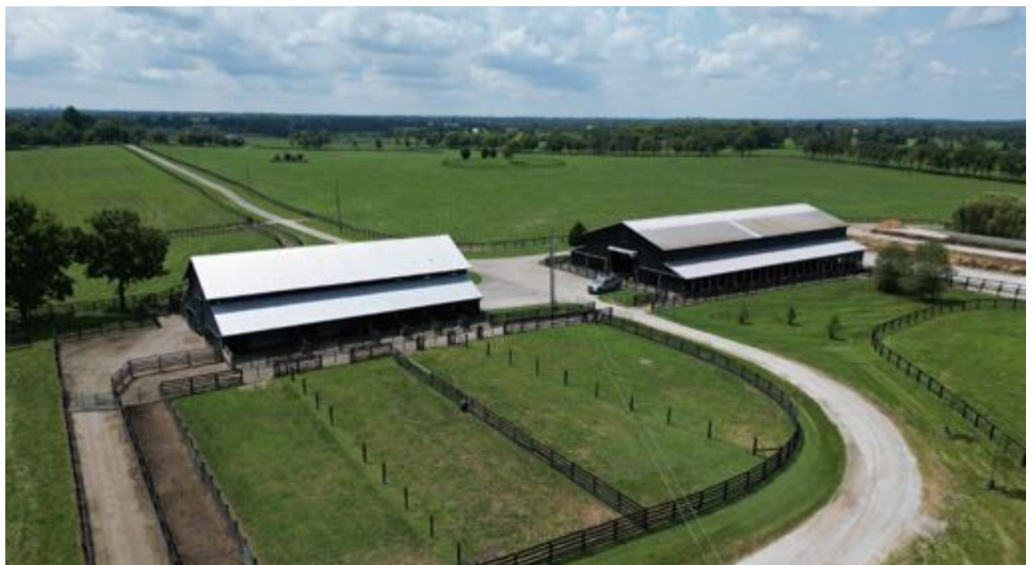
Barn on left is 57x94 with 2 BR 2 BA apartment with office